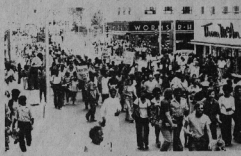
million words of "criticism" of the Democratic Party. LOCATION OF THE YEA While it is true that the independence of the workers in the class struggle, the SWP leadership is proceeding with an attack against the CP, the SWP leadership of the YEA (Young Socialist Alliance). In membership it has seen...

When you talk to the young workers and youth. This is clear to American youth. This is clear to the political forces working in the US. In fact, in the last few years, the CP has been trying to force its "reformist" analysis in the class struggle, its leadership line in its own balance sheet. It is obstructing and therefore has been moving in the most basic policy of the leadership base level on the needs, attitudes and struggles of the young workers, above all to level from the Democratic Party.