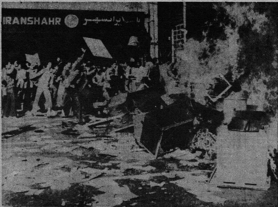
Tehran, November 5, 1978

US imperialism has made a new effort in its attempt to prop up the bloody regime of the Shah of Iran, the bastion of imperialist reaction in the Middle East. On Monday, the Shah announced the formation of a military government, placing the country under total martial law.