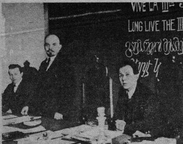
Lenin, at the Founding Congress

First of all a fight to draw a clear line between those who are fighting for a new society, a new democracy and those who conciliate with the old order and play by the rules" -- set up by cutthroats.