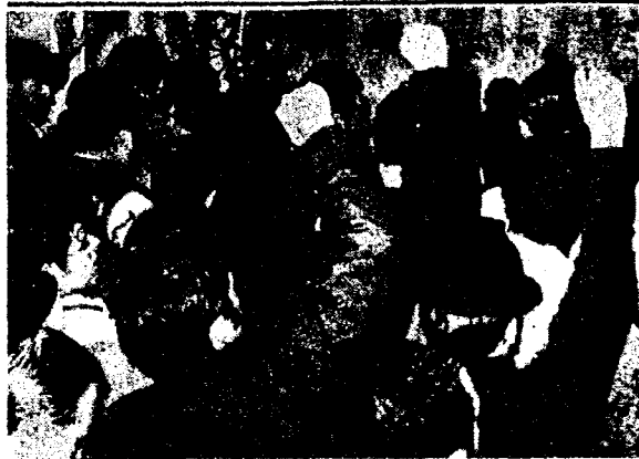
COPS clench fists for walkout—1971.