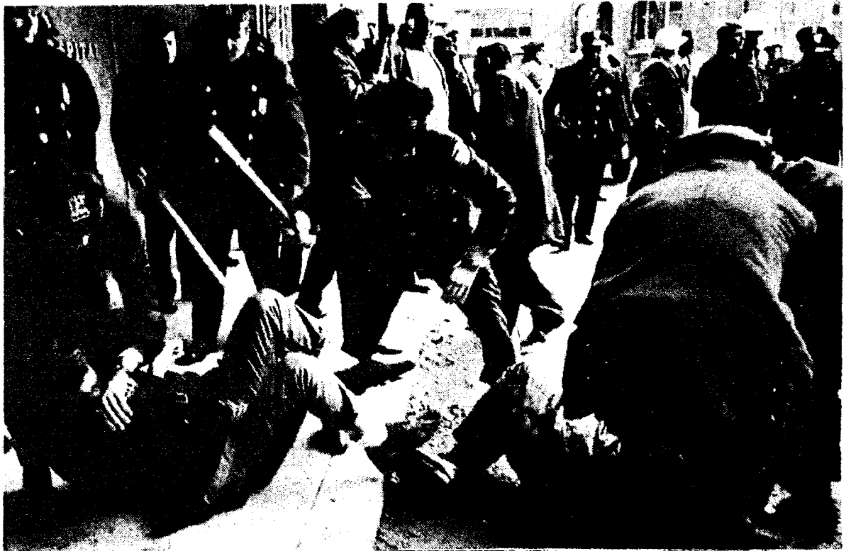
COPS HARD AT WORK—BRONXVILLE, N. Y. HOSPITAL STRIKE, 1965.

Behind all this is more than the usual bargaining period dramatics. A deep economic and social crisis, consisting of increasing widespread unemployment and general eco-