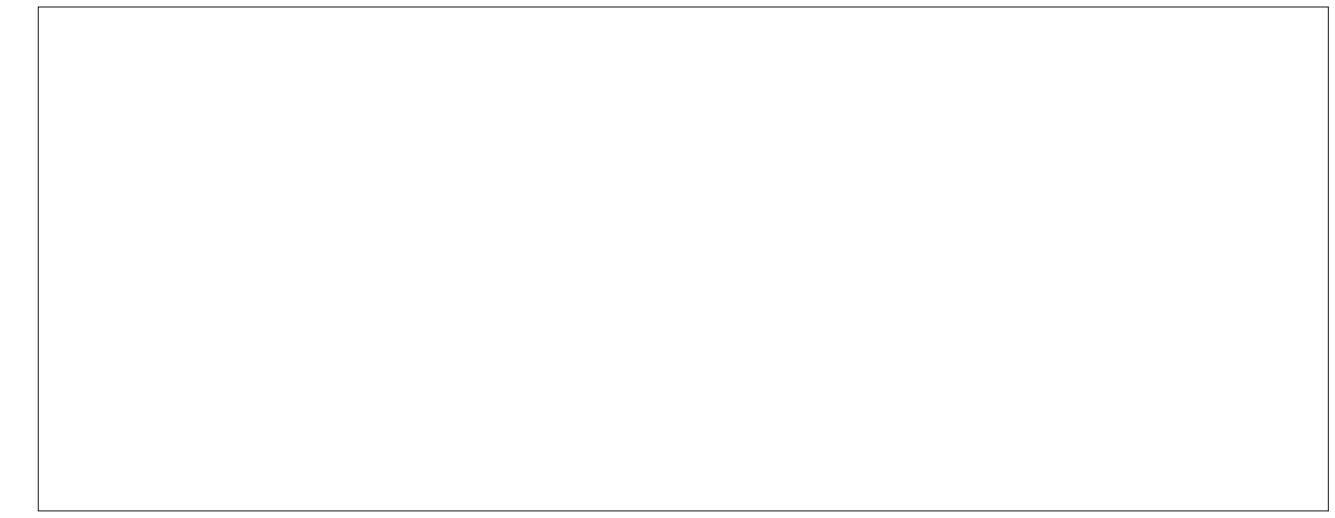
Unions need to do more than try to nudge Miliband and Balls in a slightly different direction

McCluskey says: "The view that deficit reduction through