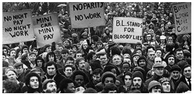
Militant car workers, 1970s

I do remember that things were different once. I do have faith that they can be different again.