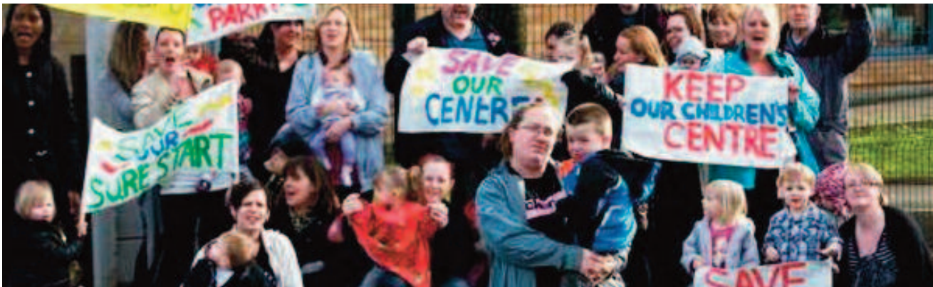
Children need parents. Parents need support.