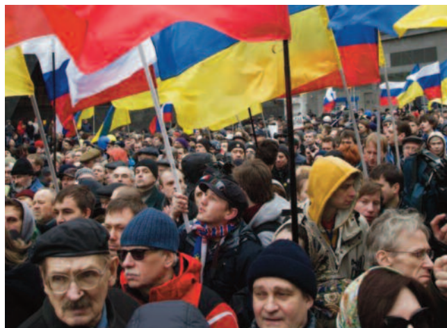
15 March Moscow demonstration against Putin's policy in Ukraine

The claim that fascists control Ukraine is propaganda by