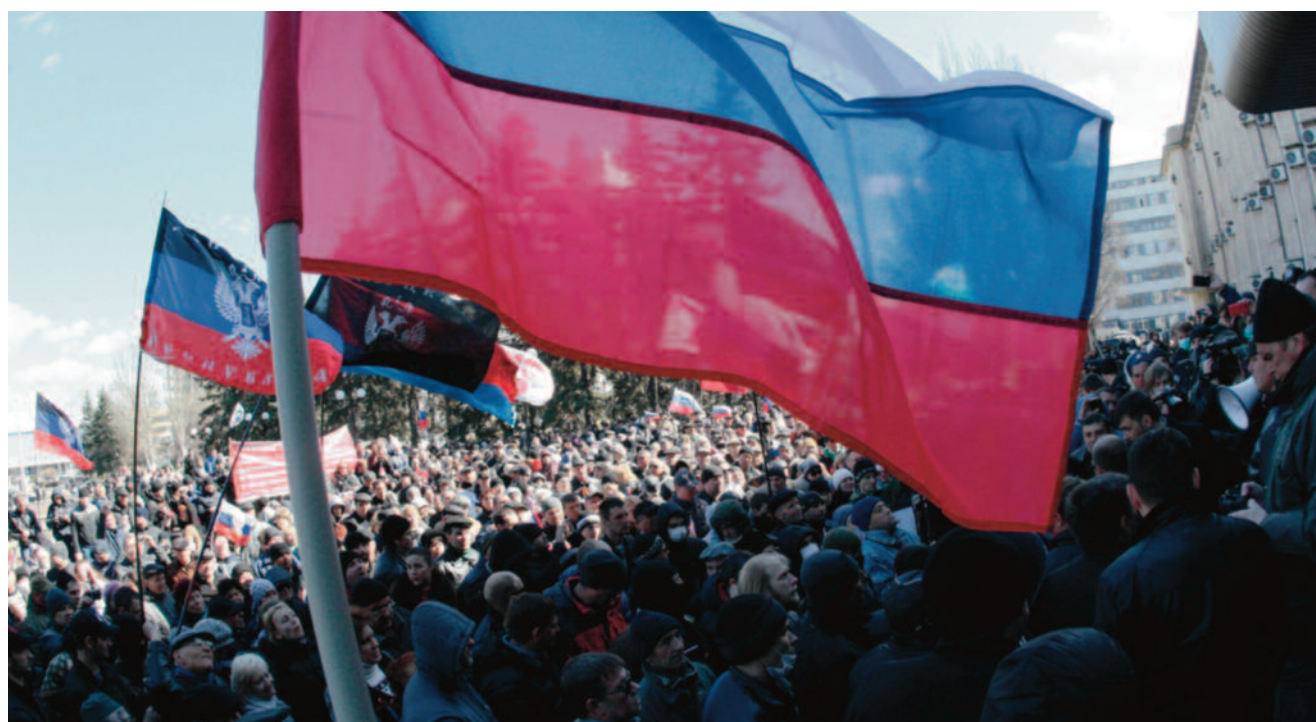
Demonstration in Donetsk

Only 13% (in Ukraine and Crimea combined) supported