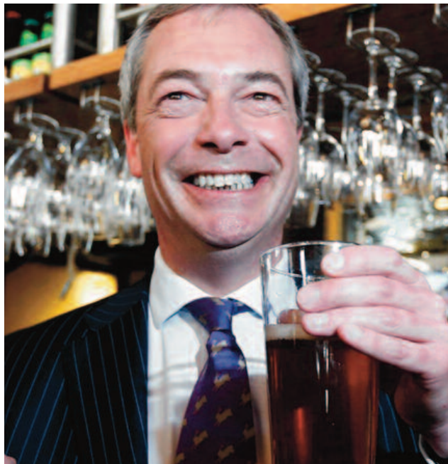
Farage falsely presents himself as an anti-establishment outsider.

Part of UKIP's appeal is disgust for post-expenses scandal politics, and for politicians who are seen to be detached and corrupt. Maria Miller's recent performance in parliament — parading her contempt in a 32 second apology for expenses fiddling — will help Farage. But "disgust" is a negative political response, and can be easily manipulated by right-wing loud-mouths.