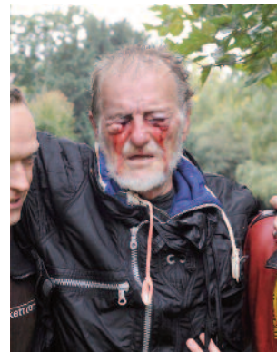
Water cannon victim

veloped during the riots across Britain in the early 1980s, but were never used.