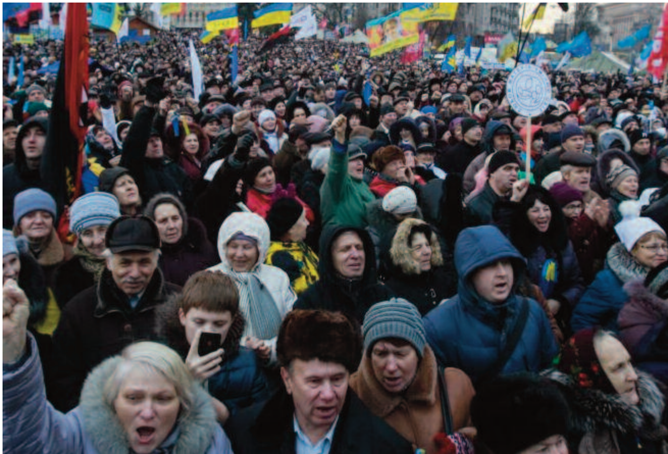
Protests in Ukraine began in November 2013 after the government of Viktor Yanukovich abandoned plans for closer ties with EU