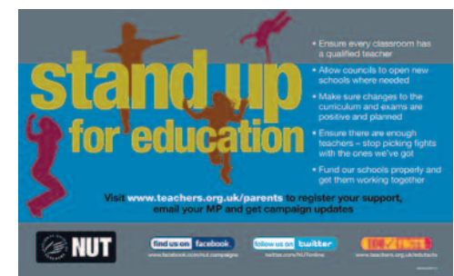
Rebranding no substitute for clear demands

When the campaign was finally revived in 2013 it involved working with the second biggest union, the NASUWT, and the issues in dispute expanded to cover