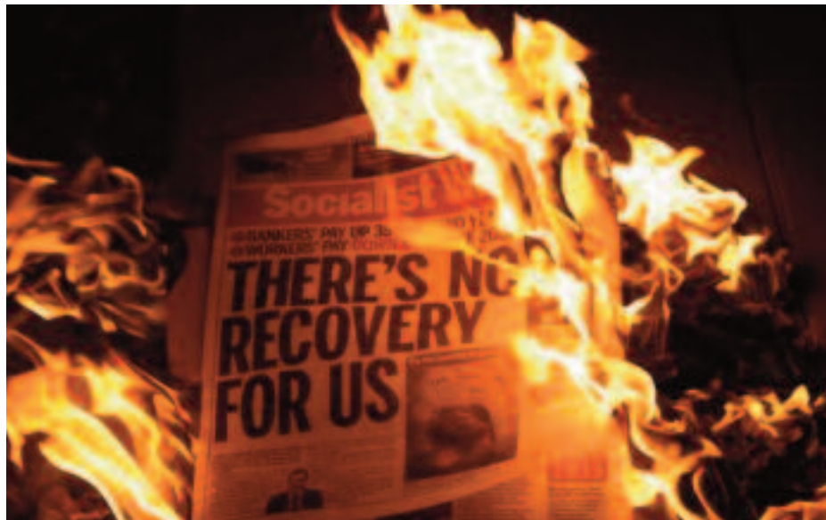
At Sussex University, some students have tipped over SWP stalls and burned copies of SWP that SWPers were offering for sale

The ISN was started by people quitting the SWP, and has