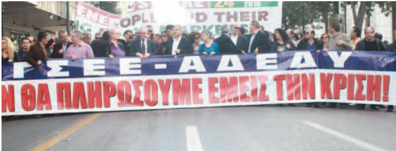
GSEE-called strike should be the beginning of a battle plan