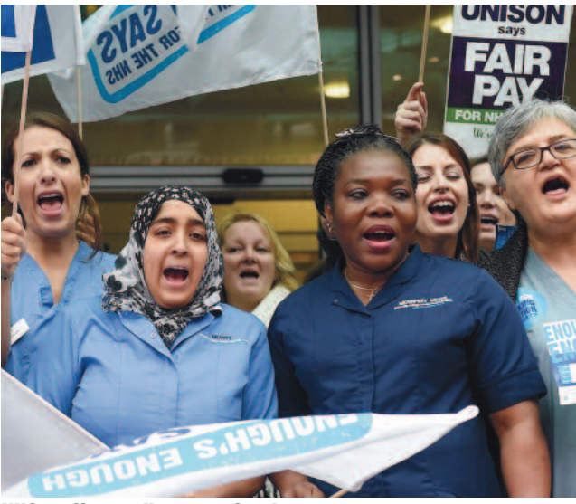
NHS staff on strike on 13 October

Neither the Tories nor the Lib-Dems argued for these changes in their 2010 general election campaigns and their initial coalition agreement made no mention. Such a huge