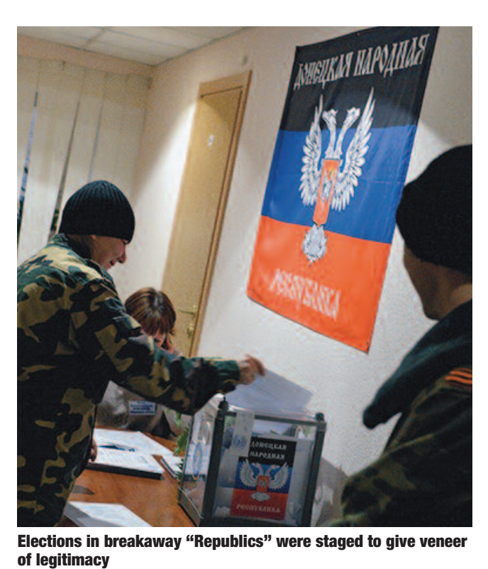
medical services) were being issued to voters at the polling stations The elections, actually non-elections, were staged only as part of a propaganda war to try give a veneer of legitimacy to the Russian-backed breakaway "Republics".

Only the genuine socialist forces in Ukraine can rally the working class for a unified struggle against national and social oppression.