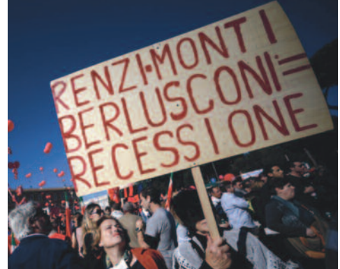
Protesters are angry at continued austerity

The millions on the streets may indicate that the rela-