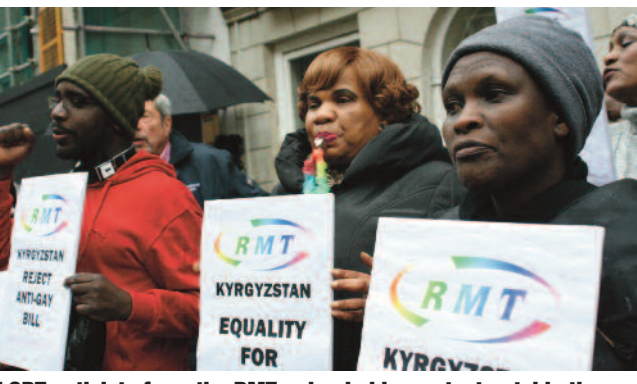
LGBT activists from the RMT union held a protest outside the Kyrgyzstan Embassy to protest at new anti-gay laws and to show solidarity with LGBT people in the Kyrgyz Republic