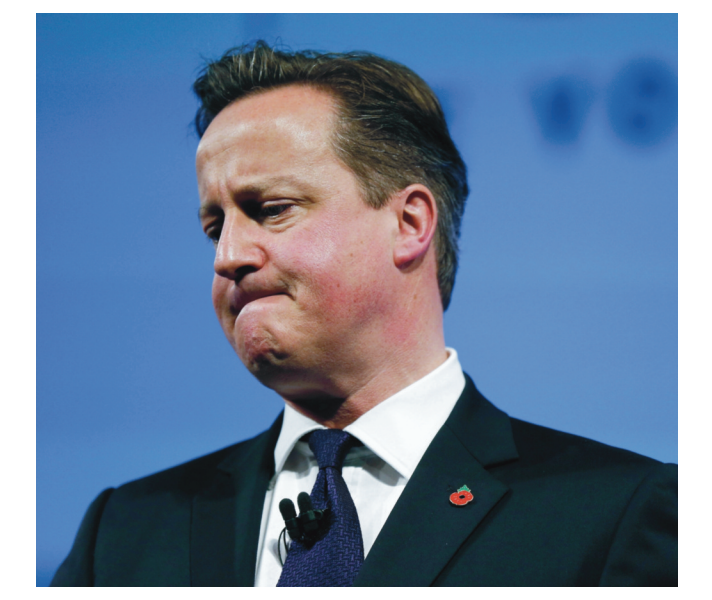
Cameron at the G20 summit in Brisbane

The task for revolutionaries could not be more imperative - propaganda and agitation for the necessity to forge the most massive democratic working-class led force with the aim not just of going beyond the compromising leaders and defeating Renzi on this front but of going for an all-out general strike and for a government of the working masses which poses concretely the question: who rules? Them or us?