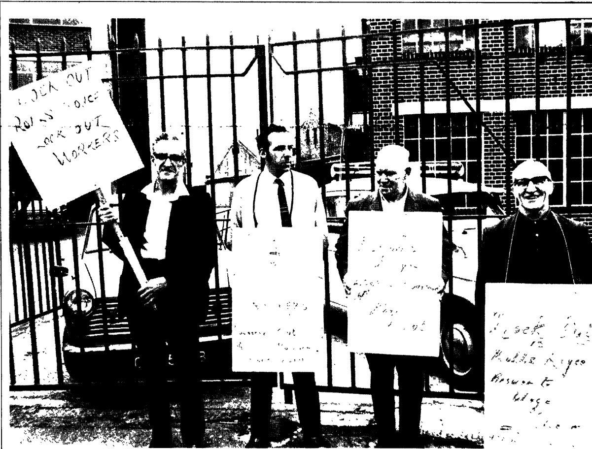
Workers at the Rolls-Royce plant in Willesden, London, where there is a pay strike.

AN emergency mass meeting was called for 7.30 last night in the Queen's recreation park, St Helens, Lancs, by the rank-and-file strike committee to clarify their position and any misunderstandings that may have arisen in the present strike situation.