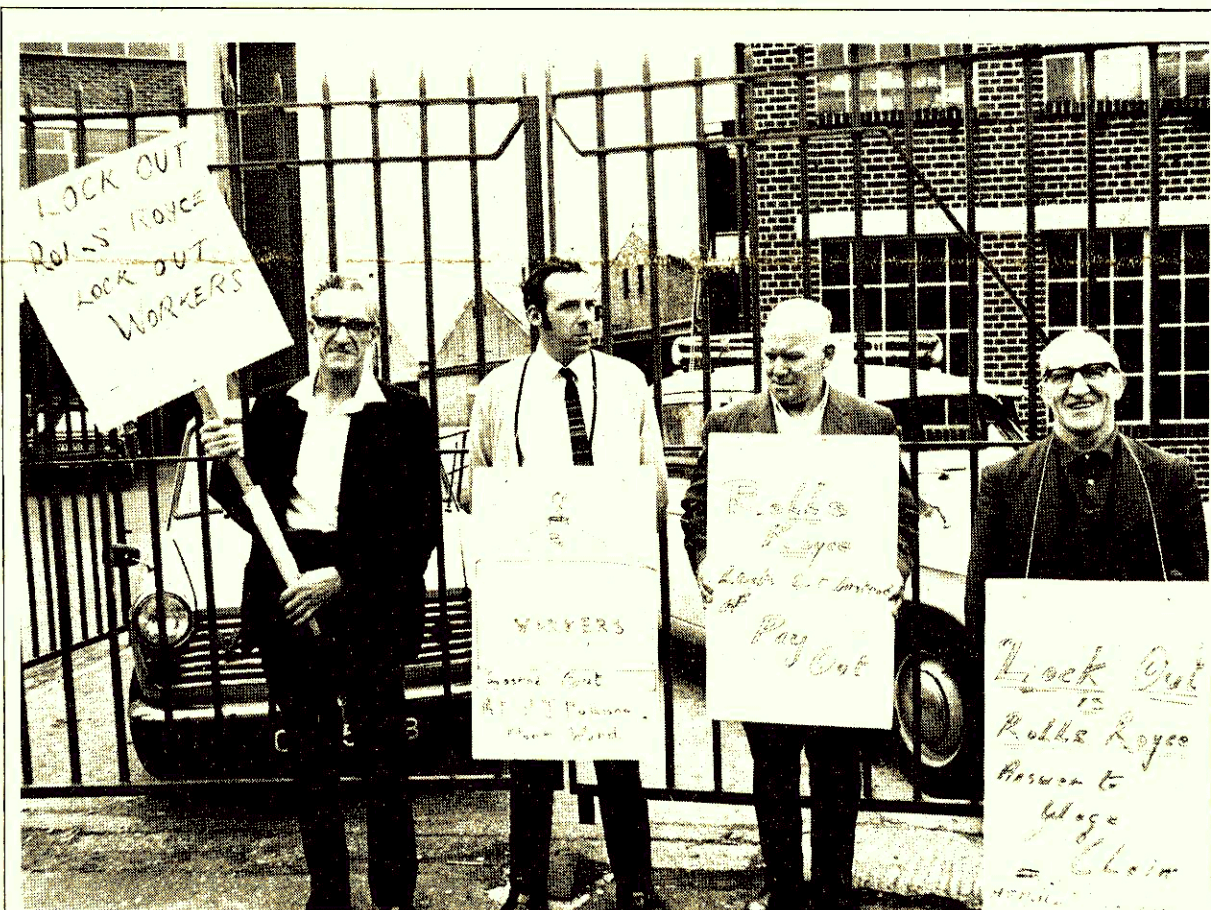
Workers at the Rolls-Royce plant in Willesden, London, where there is a pay strike.

AN emergency mass meeting was called for 7.30 last night in the Queen's recreation park, St Helens, Lancs, by the rank-and-file strike committee to clarify their position and any misunderstandings that may have arisen in the present strike situation.