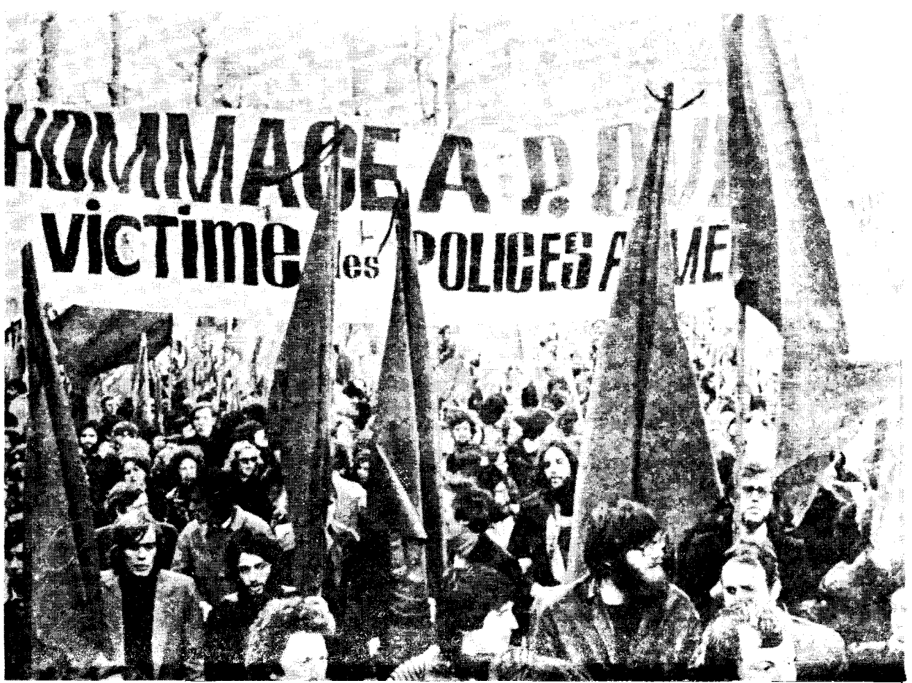
Informations Ouvrieres, 8-15 March 1972

In recognition of this trend, the CFDT has most recently moved to expel left elements, in particular Trotskyists, from its ranks in order to move closer to the CGT. Two members of