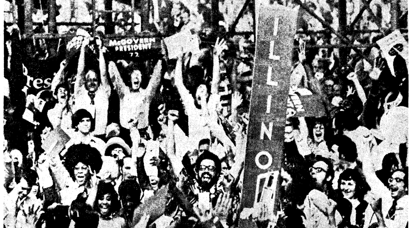
1972: Safely co-opted anti-war forces cheer McGovern inside Democratic Party Convention in Miami.

The only course open to socialist and labor militants in the 1972 election is to work for the creation of an organized movement for a labor party in the trade unions, based on militant caucuses and the transitional program. The struggle for an independent party of labor, while it may recruit some trade union leaders, must be based on a rank-and-file movement to replace the reformist bureaucracy with a revolutionary leadership, since it is this bureaucracy which maintains capitalist politics in the unions. An important part of this groundwork will be local campaigns run by the trade unions with their own candidates and calling for a break with all capitalist politicians and for a nationwide movement for a labor party. This call must be based on a working-class political program, including breaking state wage controls, defending the Vietnamese Revolution in the context of general opposition to American imperialism, workers' control of industry and a workers' government.