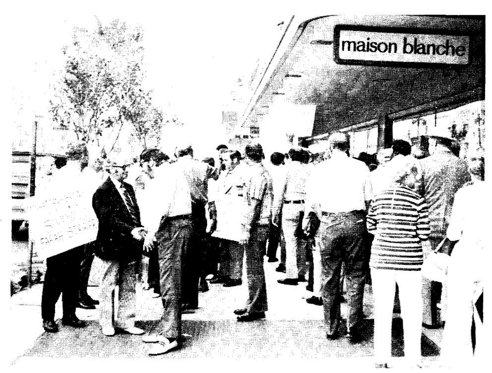
Delegates to Postal Workers Convention in New Orleans hold mass picket in solidarity with striking clothing workers.

Spartacist League was the only organized political tendency visibly in attendance at the conference. Workers Vanguard sold very well.