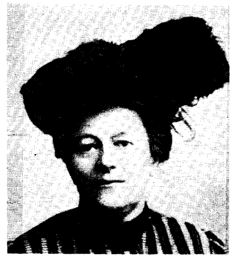
Clara Zetkin, January 1918

The emancipation of women requires the destruction of capitalism. Women under capitalism are exploited as workers and doubly oppressed by the family, the main social bulwark of women's oppression. Achieving the right to abortion would strike a blow against the material and ideological props of the family system, but the family will not wither away until a replacement for it can be created. Socialization of household duties, only possible after the abolition of private property