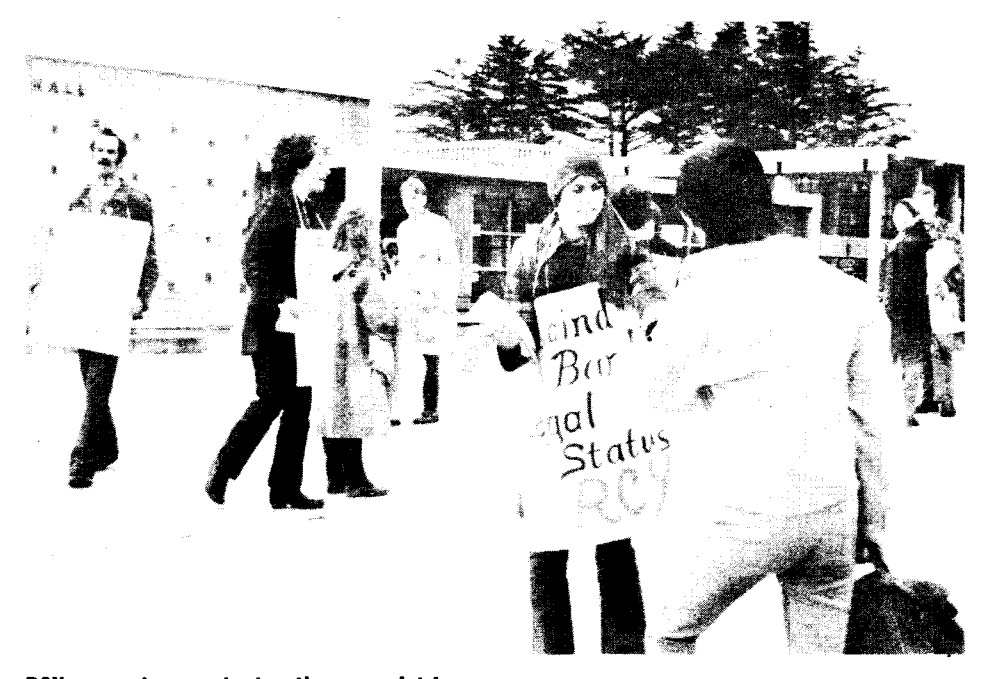
RCY supporters protest anti-communist ban.

A picket was held on 12 October which received only token support from the YSA and none from the Black Student Union or SDS chapter, though members of these groups had signed the petition defending the RCY's rights. SDS spokesmen said individuals had supported the RCY, but that SDS as an organization has not had a meeting yet to decide! This month-long stall only reflects the traditional Stalinist refusal of Progressive Labor, which completely dominates SDS, to defend against the bourgeoisie Trotskyists and others it disagrees with. The Young Workers Liberation League. vouth group of the Communist Party, demonstrates this more directly by refusing to support the RCY's rights in any way whatsoever.