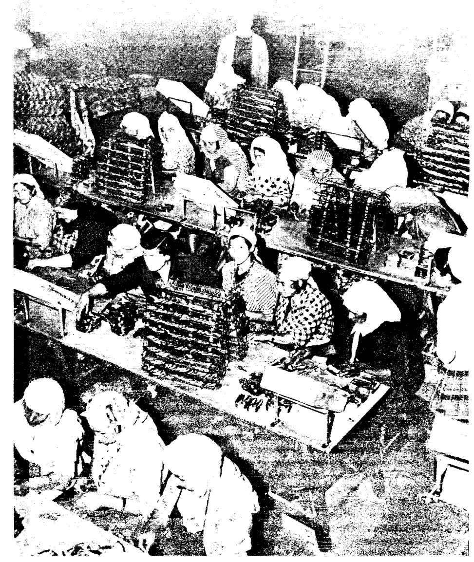
Algerian women factory workers.

Thus the bourgeoisie was never consistently democratic, even when the democratic tasks necessary to consoli-