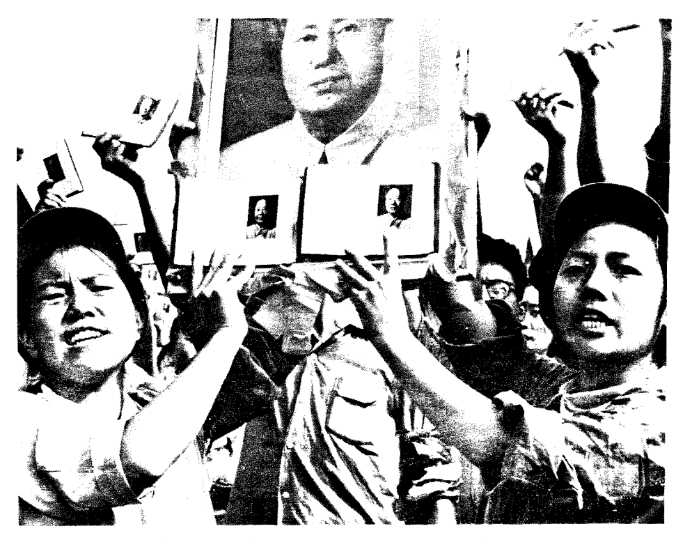
Women of the Red Guard laud Mao in Peking demonstration.

One of the differences between Bolsheviks and Mensheviks was over whether to organize an independent proletarian women's group or participate in the bourgeois feminist groups. After the final split between the Bolsheviks and Mensheviks in 1912 the