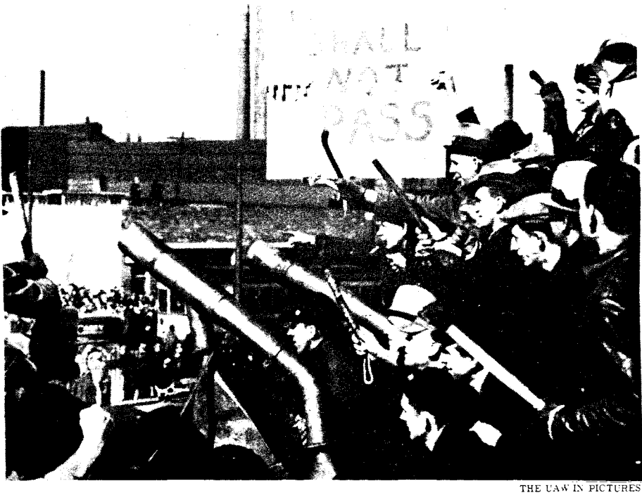
Detroit Chrysler sit-down strikers in March 1937 respond to court injunction ordering them out of the plant.

qualitative break with reformist unionism and seek to provide an alternative leadership on the basis of principled revolutionary politics instead of opportunist adaptationism and reformist panaceas. Because of this, the SL will be a real force in developing revolutionary consciousness through the development of a solid core of communist cadre in the unions, capable of exerting independent and revolutionary leadership, long after the other tendencies have thoroughly betrayed the revolutionary aspirations and goals of the working class.