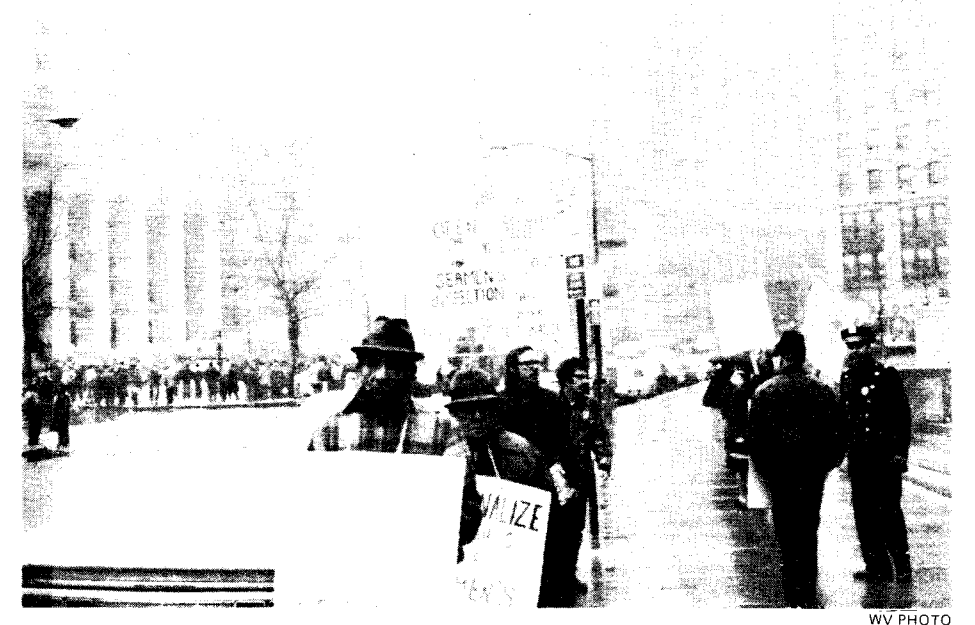
Militant-Solidarity Caucus demonstrates in 1971. "Fight runaway shipping with international seamen's unity," headlined the BEACON.

tion under Seamen's Control, "Fight against Government Control and Interference," "For a Workers Party" and "For a Workers Government."