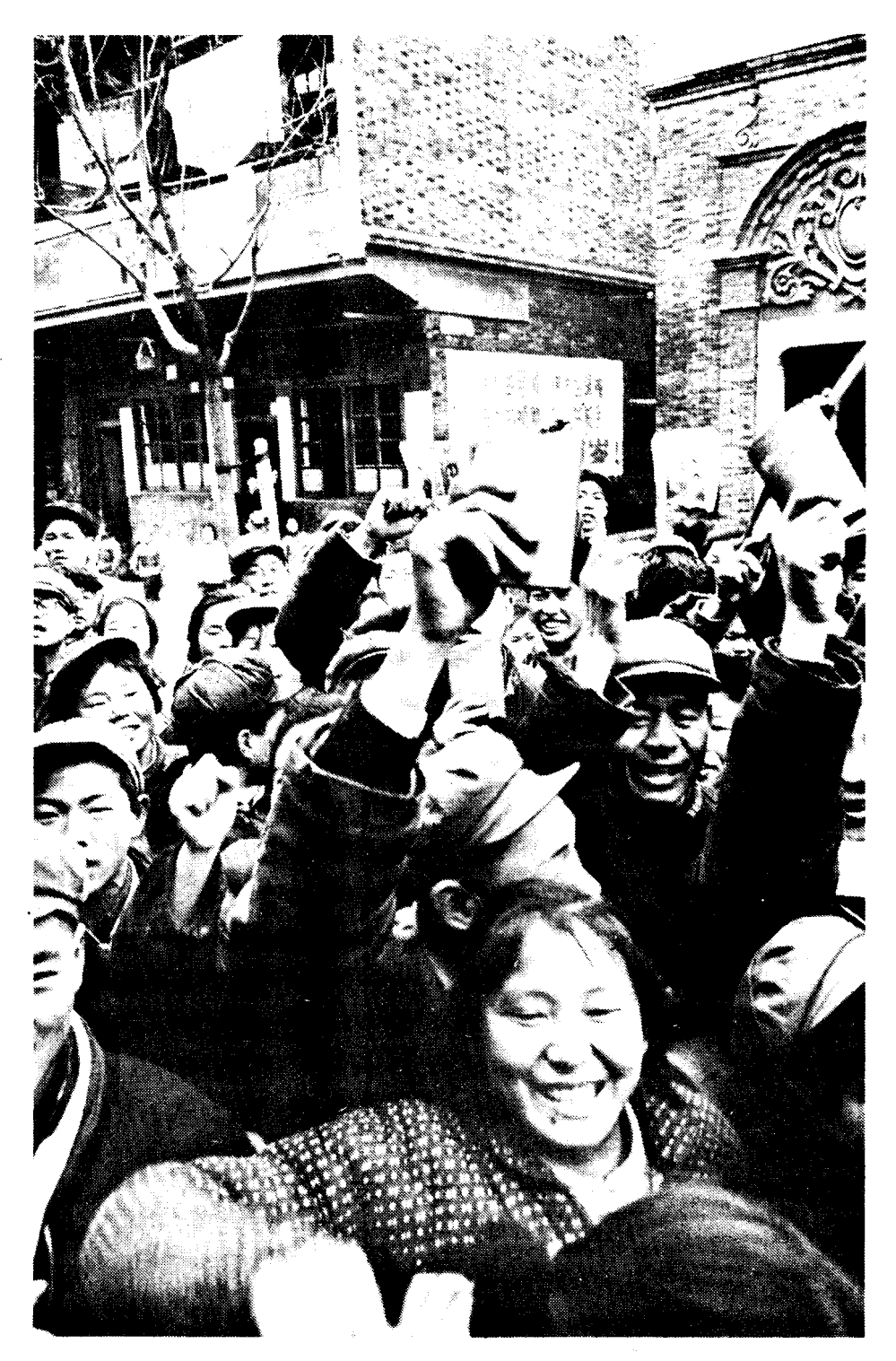
Red Guard demonstration in 1967 during Cultural Revolution.

comprehend the difference between bureaucratic criminals in a deformed workers state and bourgeois counterrevolutionaries.