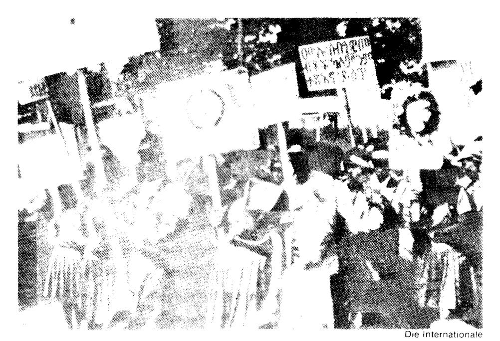
May Day march of the Ethiopian People's Revolutionary Party.

Having struck out with the "king of kings," the Kremlin consequently supported Somalia's irredentist claims to Ogaden province in eastern Ethiopia continued on page 8