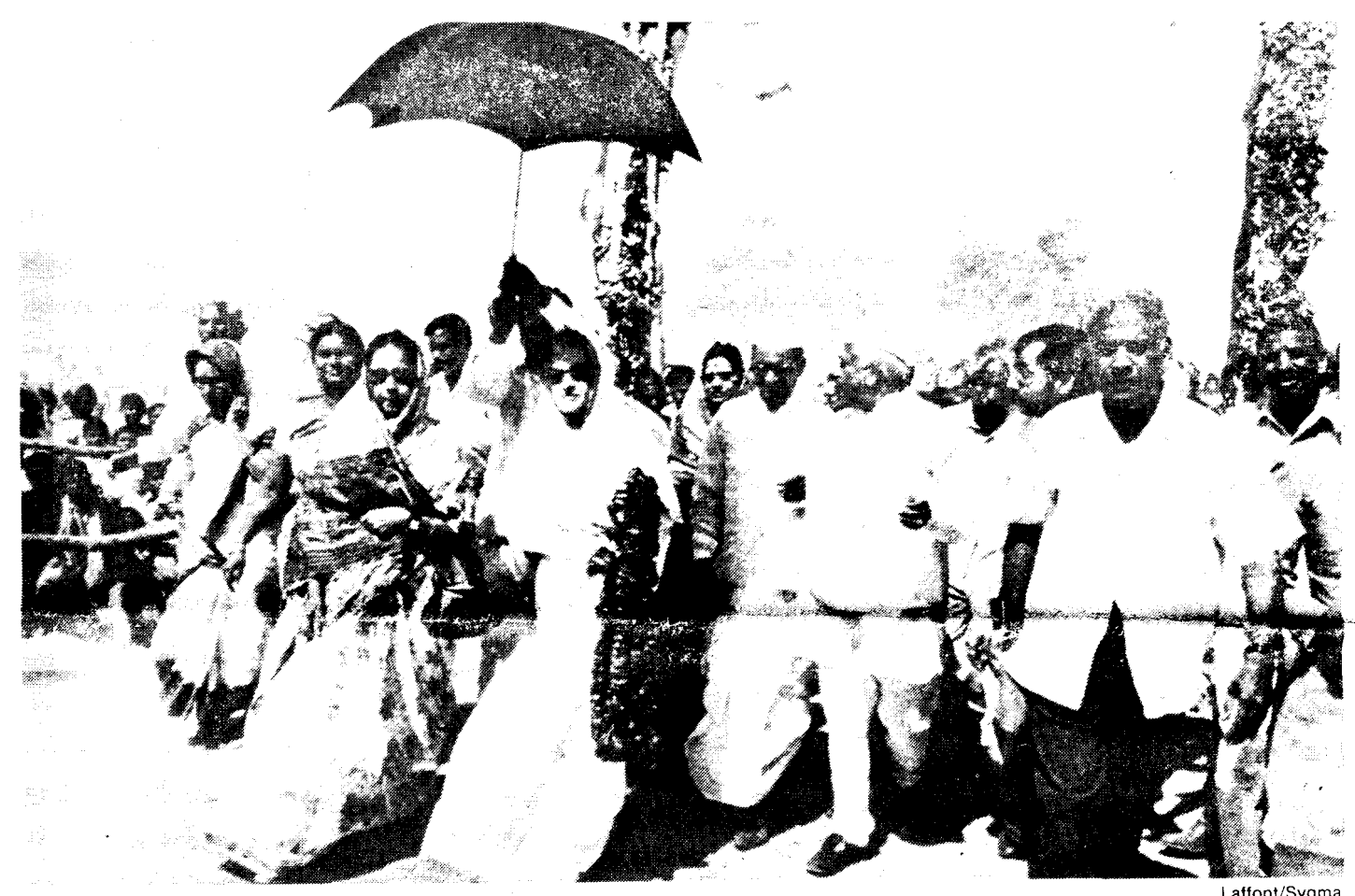
Prime minister Indira Gandhi campaigning early in the election.

The election capped two interrelated processes, long evident but greatly accelerated by the state of emergency: the steady peeling off of key components of the Congress, and the emergence of various opposition coalitions (hitherto only at the state level) as serious contenders for power. The threedecade hegemony of the Congress Party was shattered as Indira Gandhi's clique was increasingly reduced to two peocontinued on page 10