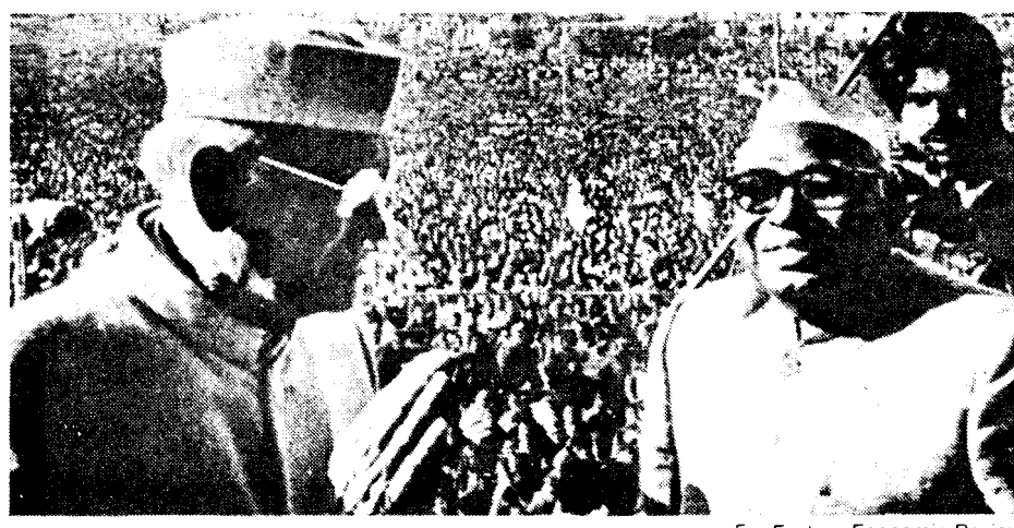
Jaya Prakash Narayan, left, with Jagjivan Ram.

non-alignment" means a shift away from alliance with the Soviet Union. Typically, it draped great power diplomatic considerations in the language of liberal moralism. Thus the New York Times (22 March) crowed: "An impoverished people rejected the siren song of authoritarians everywhere that bread must be bought at the price of freedom." But the real point is that Gandhi never delivered on her promise of "bread," by which her suppression of bourgeois-democratic rights had been justified to the masses. The transfer of governmental power represents a rever-