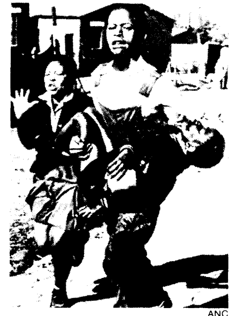
One victim of Vorster regime.

Even supposing for a moment that the impotent consumer boycott tactic were to work, it would not advance the struggle; it could in fact create enormous obstacles to the revolutionary struggles necessary to liberate the black masses. The central issue on South Africa is how the oppressed non-white working people can wrest power from the white ruling class. Certainly, it is not through the withdrawal of foreign corporations and a contraction of international trade. That would only spell increased unemployment of black and "coloured" workers and a weakening of their social power, which has been