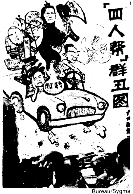
Wall poster denouncing the "Gang of Four."

The Chiang Ching group was generally regarded, with good reason, as the most fervent and loval supporters of Mao Tse-tung within the Chinese leadership. Thus the violent purge of the "gang of four" as "bourgeois counter-revolutionaries" immediately after the Great Helmsman's death was received by the world Maoist movement with shock, dismay, dissent and outright opposition. In West Europe "critical Maoist" groups such as the West German Kommunistischer Bund, the Swedish Förbundet Kommunist and the French Organisation Communiste dès Travailleurs have declared that the purge of Chiang Ching signaled the victory of "capitalist roadism." In the U.S. the philistine-workerist Revolutionary Communist Party has been