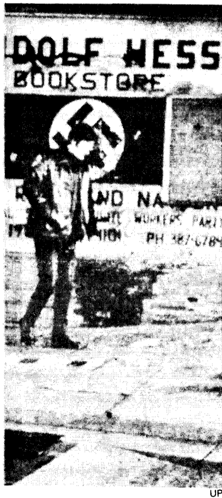
S.F. Nazi bookstore after trashing.