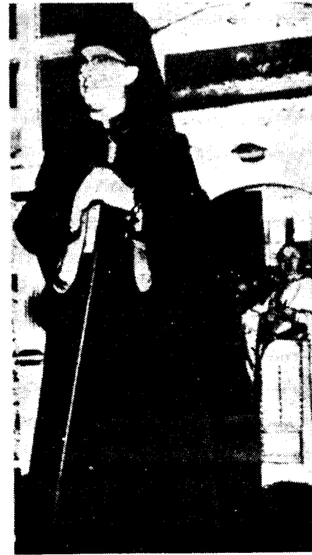
Bishop Trifa in 1954