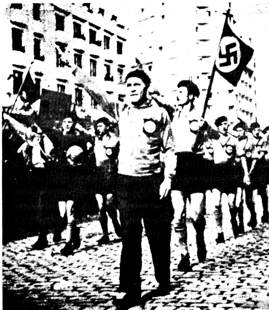
Rumanian Iron Guard marching in 1936.