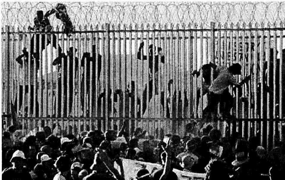
Left: Refugees break out of Woomera Detention Center as supporters rally outside, March 29. Cops retaliated with brutal attack on demonstrators.

Riot police on horseback rode into the swarm of protesters, bloodying many. Cops sealed off the protesters' camp and imposed a virtual state of siege on the surrounding area, setting up roadblocks