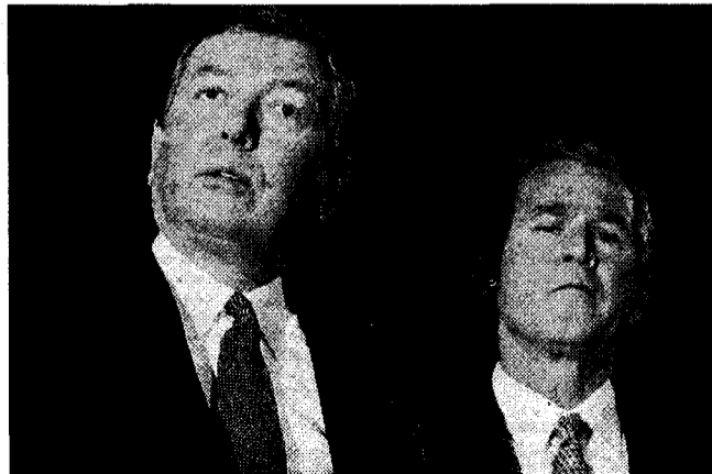
Immigrant detainees at Hudson County Correctional Center in New Jersey. Hundreds have been rounded up in Ashcroft's racist "anti-terror" sweeps.