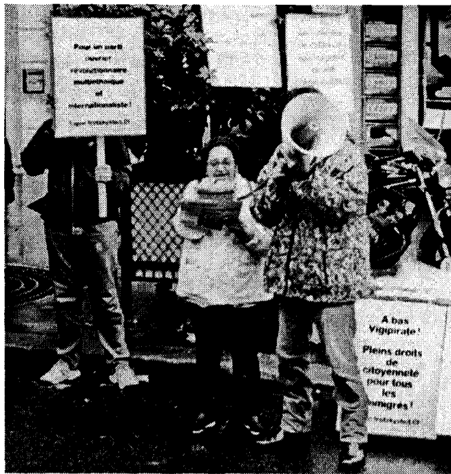
September 2001: LTF protests imperialist intervention in Afghanistan. Sign at right reads: "Down With Vigipirate! Full Citizenship Rights for All Immigrants!"

While being silent on Vigipirate, LO enthusiastically and promptly stated its solidarity with the police "strikes" last fall. These were reactionary strikes