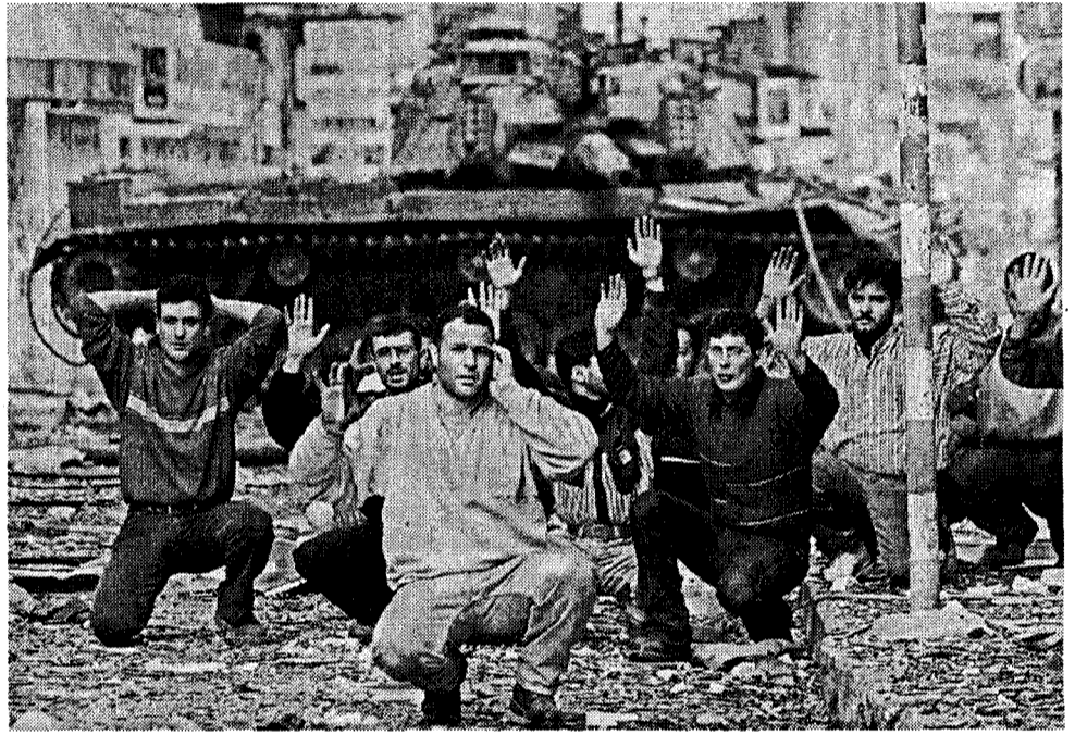
Left: Israeli army assault on Palestinian Authority headquarters in Ramallah, March 29. Palestinian men rounded up in West Bank as Zionists reoccupy Palestinian ghettos.

APRIL 1—Following an Arab League meeting that refused to endorse U.S. plans for an attack on Iraq, Washington dispensed with its recent pretense of “even-handedness” toward the Palestinians, tacitly approving Israeli prime minister Ariel Sharon’s invasion of one West Bank town after another. In Ramallah, home to 200,000 Palestinians and unofficial headquarters of Yasir Arafat’s Palestinian Authority (PA), whole areas have been reduced to rubble, 700 people arrested and dozens killed, at least five apparently executed “with a single coup de grace administered to the head or throat” (London Observer , 31 March). As Israel further tightens the noose around Arafat, now imprisoned in his darkened office with little more than a handful of supporters and a dying cellphone, Bush cynically chastises him for not doing enough to stop Palestinian terrorism! Now, Sharon has issued an open declaration of war against the Palestinian people.