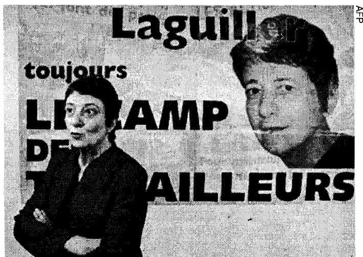
Arlette Laguiller, presidential candidate of Lutte Ouvrière, is silent on government's Vigipirate campaign against minorities.

In this election campaign there is only one candidate who seeks to draw a crude class line against the capitalist government: it is Arlette Laguiller, spokesman for Lutte Ouvrière. We agree with her when she says that the Socialist Party (SP) leaders are from the same world as