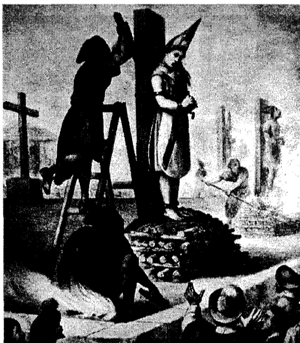
University of California, Santa Barbara

"In Calvinism," Engels went on to point out, "the second great bourgeois upheaval found its doctrine ready cut and dried." Engels was referring to the English Revolution and attendant civil war (1642-1649), whose whole course bears out his analysis. There is a very