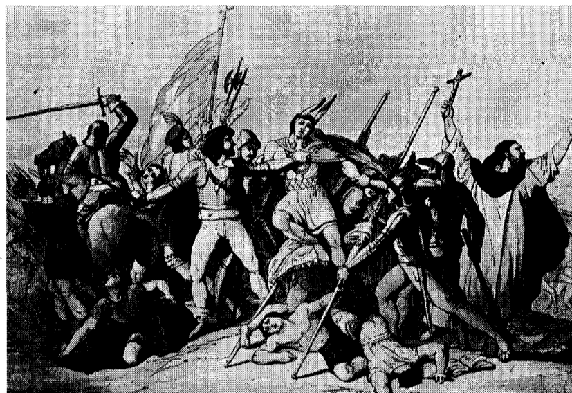
Theodore de Bry

Left: Spanish Inquisition's reign of terror stultified country's intellectual life, economic vitality. Pizarro (depicted above) and others extended legacy of Spain's backwardness to Latin America.