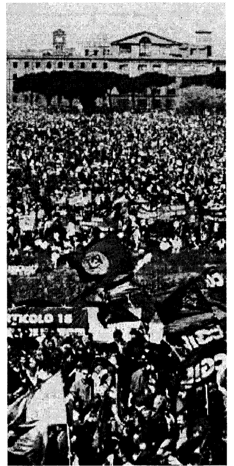
Rome, March 23: Three million protest government attacks on unions.

In response to the Rome protest, Umberto Bossi blamed the unions for Biagi's assassination, ranting: "First they killed him, now they are appropriating to themselves the victim." This statement has sparked outrage among workers throughout the country. Enraged union officials canceled talks with the government scheduled for March 26 and called for more demonstrations. CGIL head Sergio Cofferati is demanding that the government retract its accusation that the labor movement breeds terrorists. Reflecting worries in the bourgeoisie that Berlusconi & Co. are provoking upheavals, Italian president Carlo Ciampi praised the Rome demonstration as "the salt of democracy."