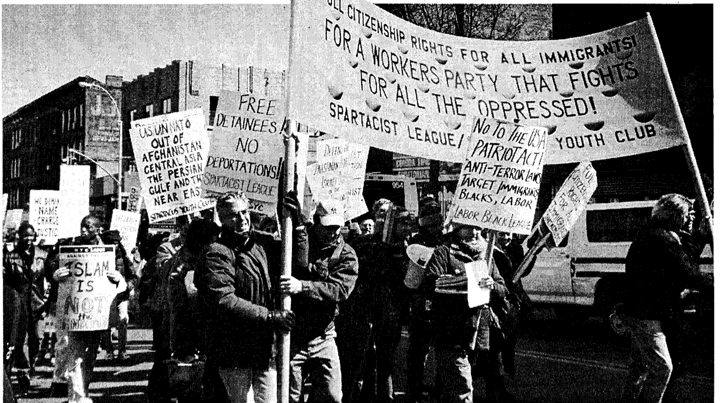
Spartacist contingent at Brooklyn protest against detention of Arab and Muslim immigrants, March 23.