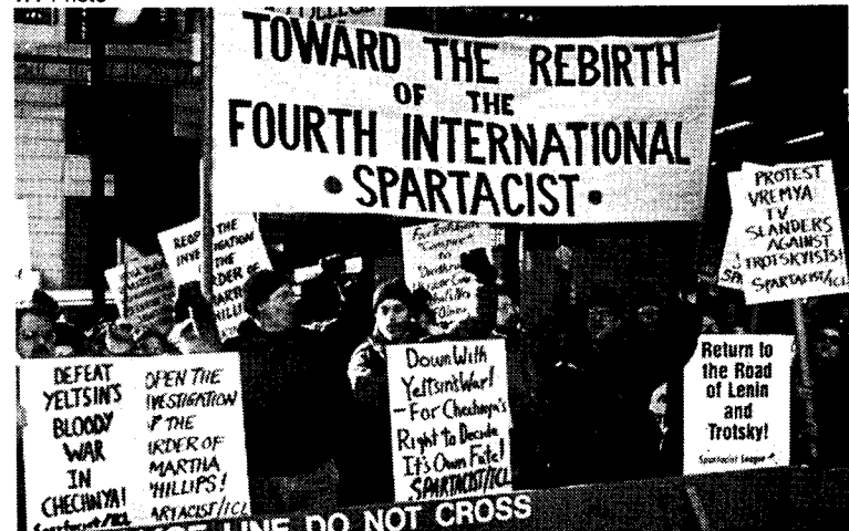
1995 New York City protest against Ukrainian government witchhunt of ICL (left). Front-page Ukrainian newspaper (30 March 1995) smear: "Overthrow Government in Ukraine, Intended Touring Trotskyists."