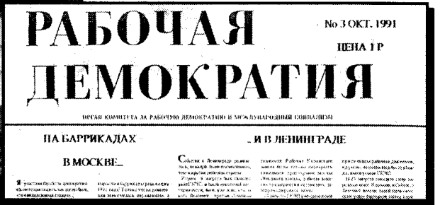
Yeltsin's counterrevolutionary rabble outside the White House in Moscow, August 1991. Russian Militant tendency newspaper Rabochaya Demokratiya (October 1991) boasted: "On the Barricades in Moscow..." "...And in Leningrad."