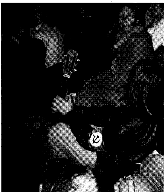
Taaffeites welcomed fascists of National Bolshevik Party to their 1998 May Day Moscow forum (right). Above: National Bolshevik Party-depiction of "ideal" member, modeled after Hitler's stormtroopers.