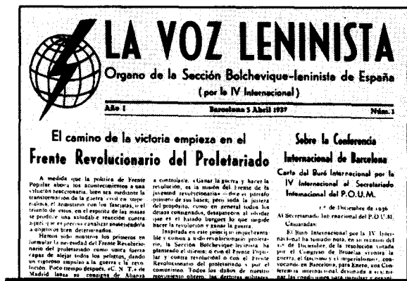
La Voz Leninista (Leninist Voice), newspaper of Trotskyist Bolshevik-Leninists of Spain. American Trotskyist Felix Morrow documented betrayal of Spanish Revolution by Stalinists, anarchists and POUM leaders.

What was the POUM? The POUM was what we call a centrist party, i.e., a party that is revolutionary in words but reformist in deeds. It had emerged from the fusion between the Trotskyist Spanish Communist Left of Andrés Nin, and the BOC (Workers and Peasants Bloc) of Joaquin Maurín, which was a more right-wing centrist party that adapted to Catalan nationalism. Trotsky strenuously denounced the signing of the electoral pact by the POUM as a "betrayal of the proletariat for the sake of an alliance with the bourgeoisie" and broke political relations with them.