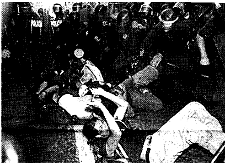
Guadalajara, May 28: Riot police brutally attack demonstrators protesting summit meeting of European and Latin American heads of state.

The Summit—whose objective was for the European imperialists to get their share in the plunder of Latin America and the Caribbean (traditionally the fiefdom of U.S. imperialism)—with breathtaking hypocrisy passed a resolution in which they claim to be "horrified by the recent evidence of mistreatment of prisoners in Iraqi jails." Hours later, however, the holding cells at the State of Jalisco Department of Justice became the stage for torture acts reminiscent of some of those that have characterized the colonial occupation of Iraq, in dungeons like Abu