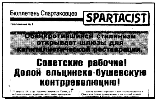
ICL banner raised in Moscow at 1991 demonstration on anniversary of October Revolution. Historic ICL leaflet mass-distributed in USSR proclaimed: "Soviet Workers: Defeat Yeltsin-Bush Counterrevolution!"

was a Potemkin village "International" which would finance and otherwise support their unprincipled trade-union maneuvers, including an LM leader's position as an unelected "adviser" to this cop-ridden union. (See "A Break in Fraternal Relations with Luta Metalúrgica," WV No. 648, 5 July 1996.) But for the IG the idea that we would break with a Latin American group with a "base" in the trade unions on the basis of principle was unthinkable.