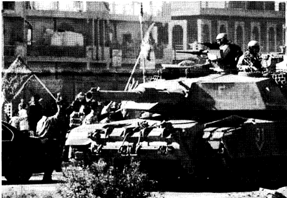
U.S. occupation forces patrol Sadr City, Baghdad, April 5.

On the ground in Iraq, the U.S. military has sparked widespread resistance to its savage occupation. Hoping to pacify largely Sunni Falluja, the U.S. brought out of mothballs a former general in Hussein’s military and installed him as the commander of the puppet Iraqi forces in the area. More recently, the Americans have been scrambling to cut a deal with the Shi’ite forces in Najaf under