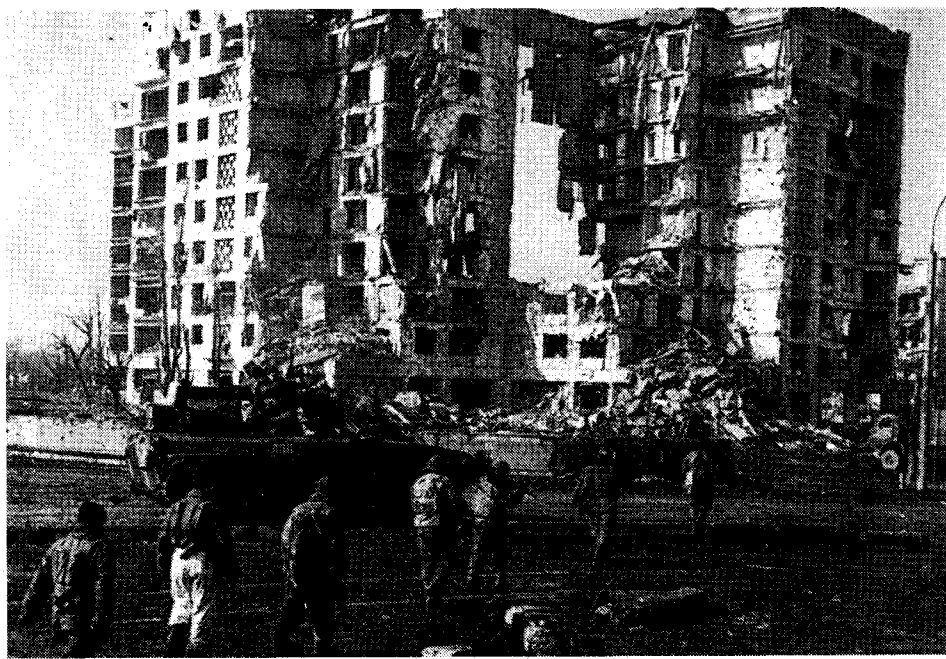
February 2000: Chechen capital Grozny ravaged by Russian army. IG's Ukraine fusion statement said nothing in defense of Chechens against Russia's genocidal onslaught.