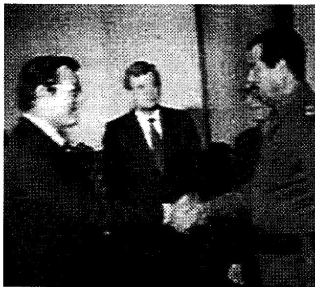
The only thing worse than being an enemy of the U.S. is being a "friend": Donald Rumsfeld with Saddam Hussein in 1983 (left); with latest former ally, Ahmad Chalabi, in 2003.

The occupation of Iraq is giving the Bush administration serious trouble, potentially a boost for the electoral fortunes of the Democrats. This is certainly what the liberals are pushing for with their "anybody but Bush" campaign. However, the fact of the matter is that the Democratic Party has been the historic party of war in the U.S., from two world wars, Korea and Vietnam to military interventions in Haiti, Somalia and the Balkans under Clinton. Because of widespread illusions that the Democrats represent the interests of working people and the oppressed, they are better posi-