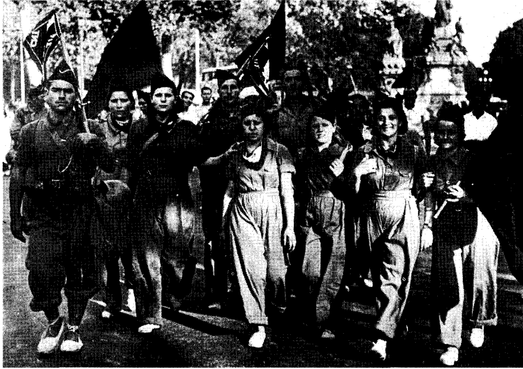
Women's militia unit departing Barcelona for Aragon front to fight reactionary Francoist forces.

The Civil War (which lasted from approximately 1936 to 1939) represented the last opportunity for the proletariat to overthrow capitalism and open the road to socialism in Spain before the rise of the Francoist military dictatorship that would last more than 30 years and kill hundreds of thousands. In the key industrial center of Spain, Catalonia, armed workers organized militias and factory committees that shook the foundations of the capitalist order, private property and the state. But the most radical mass leaders of this movement (the anarchist FAI and the National Confederation of Labor [CNT] it controlled, and the centrist Workers Party of Marxist Unification [POUM]) along with the rest of the left (the Socialist Workers Party [PSOE] and the Stalinist Communist Party [PCE]) showed their political incapacity to lead the working class toward emancipation. It was only small groups (like the Friends of Durruti anarchists and the Trotskyist Bolshevik-Leninists) who sought during the barricades fighting in May 1937 to bring revolutionary leadership to the proletariat. But these groups were not able to over-