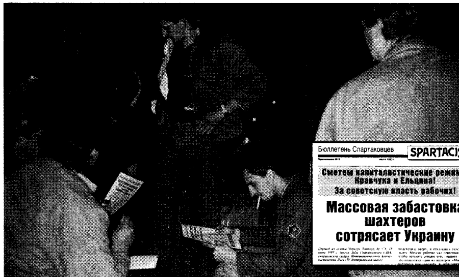
ICL Moscow Station distributed Russian-language supplement titled "How the Soviet Workers State Was Strangled" at June 1993 Ukraine miners strike. Spartacist supplement on miners strike (inset).

The IG concluded its fusion statement with the empty boast that in Ukraine it