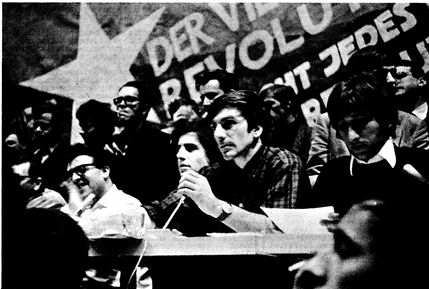
RUDI DUTSCHKE [center, in plaid shirt], leader of the Sozialistischer Deutscher Studentenbund, at conference held as part

Between 1959 and the mid-1960's the SDS grew fairly steadily and engaged in