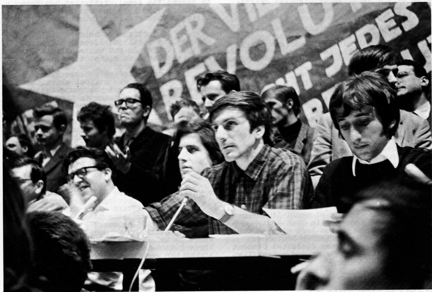
RUDI DUTSCHKE [center, in plaid shirt], leader of the Sozialistischer Deutscher Studentenbund, at conference held as part

of February 17 weekend Vietnam antiwar demonstration in Berlin involving 20,000 participants from all over Europe.