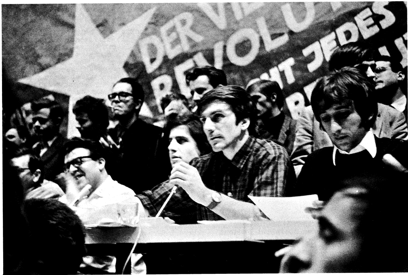
RUDI DUTSCHKE [center, in plaid shirt], leader of the Sozialistischer Deutscher Studentenbund, at conference held as part

of February 17 weekend Vietnam antiwar demonstration in Berlin involving 20,000 participants from all over Europe.