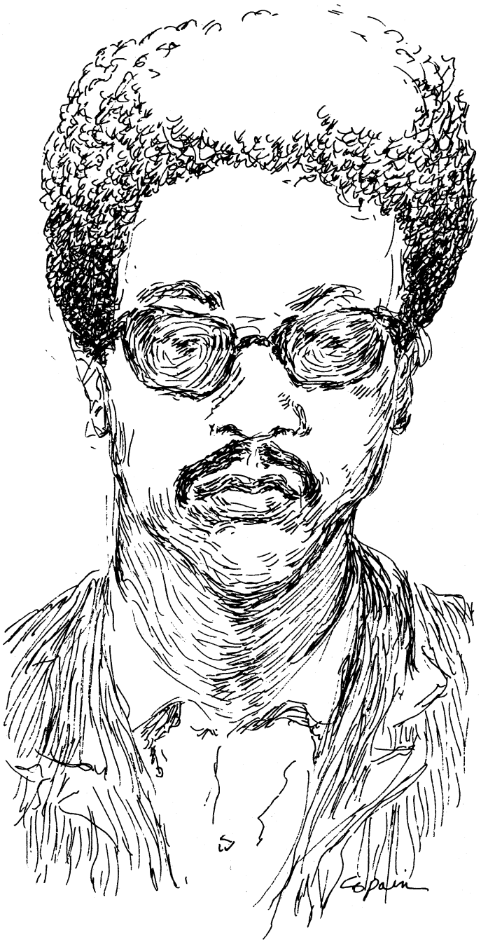
H. Rap Brown