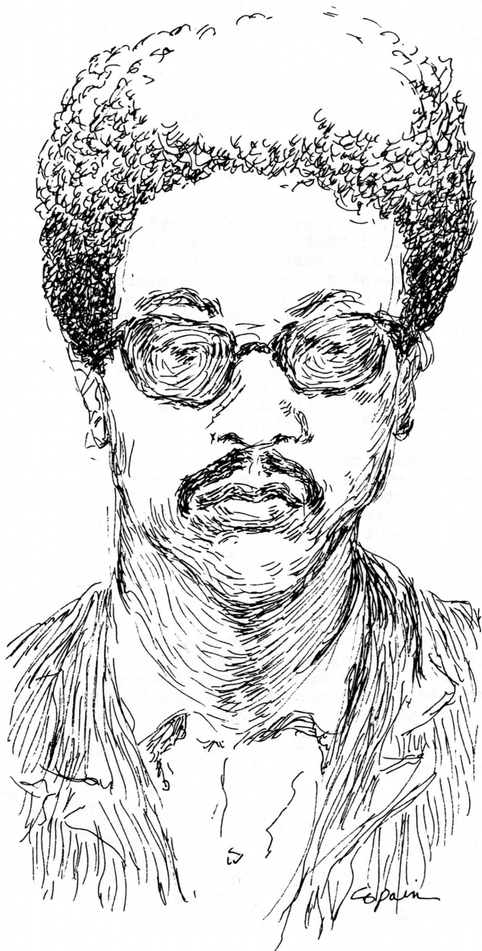
H. Rap Brown