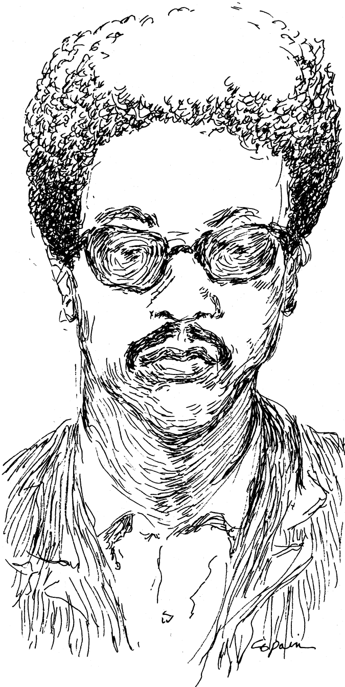
H. Rap Brown