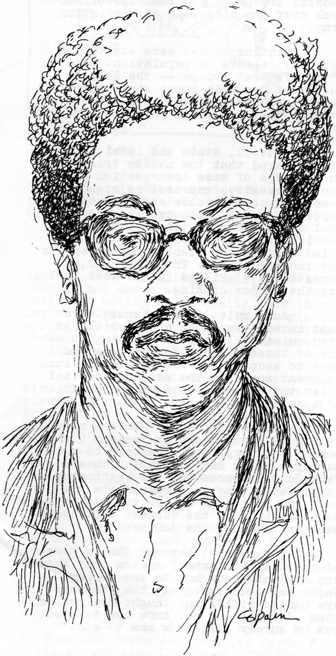
H. Rap Brown