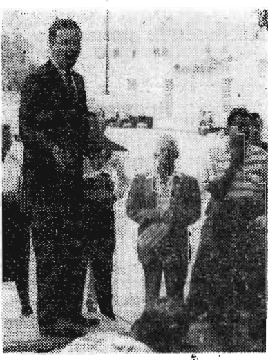
YS Editor addressing Los Angeles City College students at outdoor

However today the Soviet workers are taking care of this situation themselves. This is the mean-