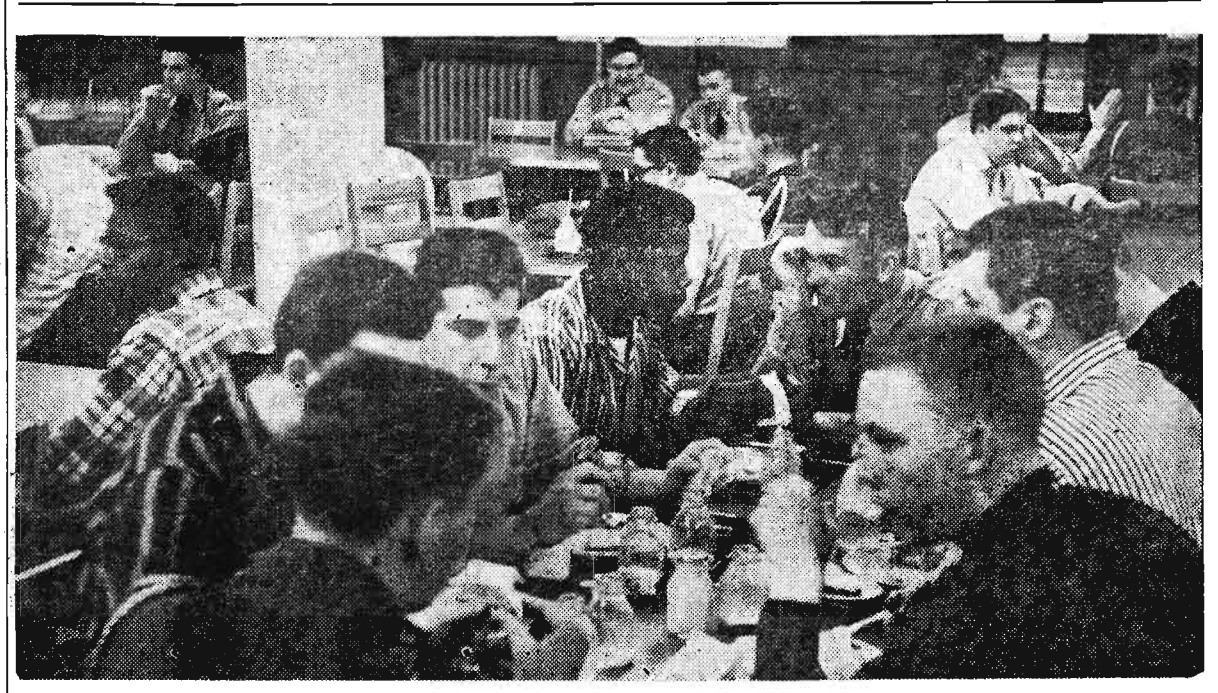
IN THE YOUTH MARCH FOR INTEGATION Oct 25, thousands of Negro and white students demonstrated against segregation and expressed solidarity with their heroic brothers and sisters in the South. They hope that scenes like the above (teenagers in a Louisville school lunchroom) will soon be commonplace. For a full report of the Youth March by a participant, see the next issue. of the YS.