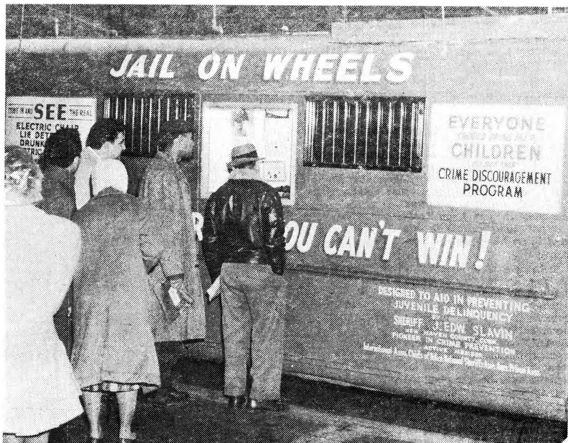
New Yorkers view display of implements of police brutality to discourage prospective juvenile delinquents. Authorities barred YS photographer from photographing electric chair.

Included among the groups which supported the boys and protested the whitewash of the patrolmen involved in the beating were Ford Local 600, the American Civil Liberties Union, which furnished legal counsel, two precinct organizations of the Democratic Party, the NAACP, and the Urban League. The Rebels, teen-age YOUNG SOCIALIST supporters, circulated petitions protesting police brutality in this case and