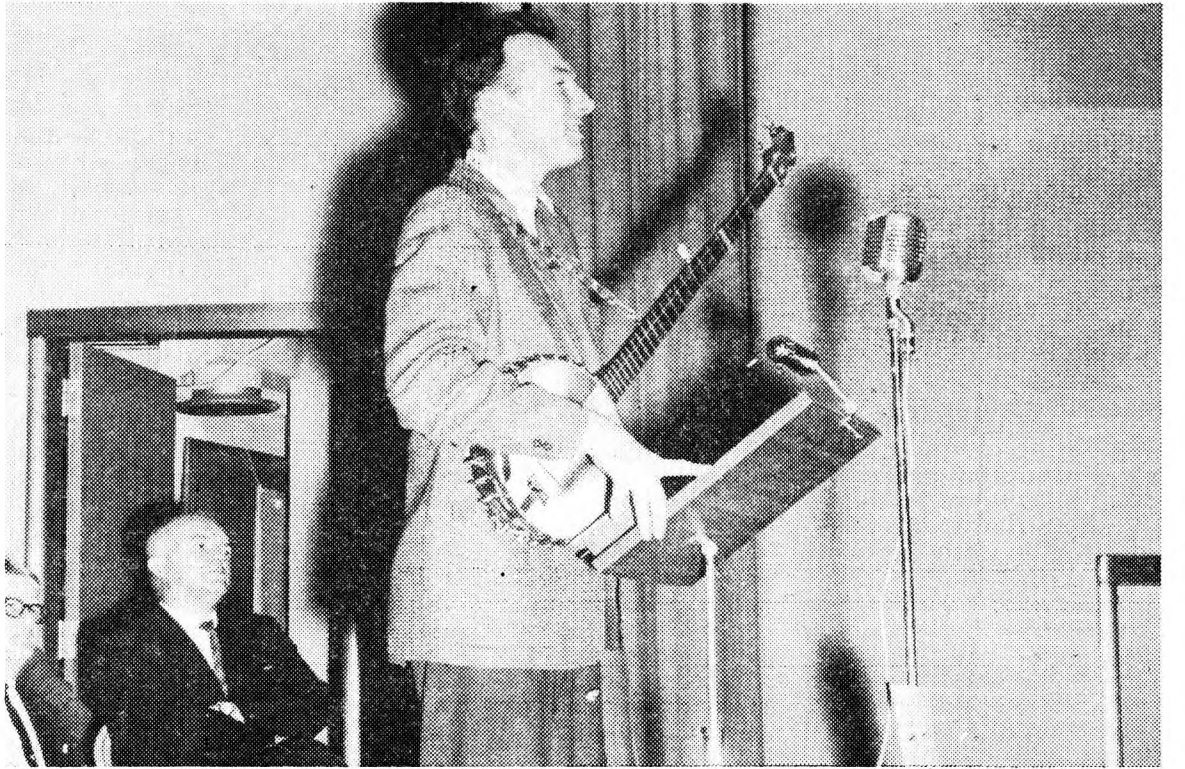
Pete Seeger sings to New York rally supporting First Amendment defendants