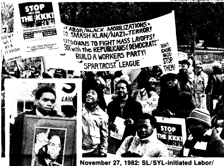
November 27, 1982: SL/SYL-initiated Labor/ Black Mobilization stopped KKK; militants honored Malcolm X.

The civil rights movement was an attempt to confront the unfinished business of the Civil War. Black chattel slaves had been emancipated only to be stripped of political rights and economically subjugated through sharecropping and debt peonage. Today blacks are still segregated at the bottom of American society, but are integrated into its economy, especially in the strategic