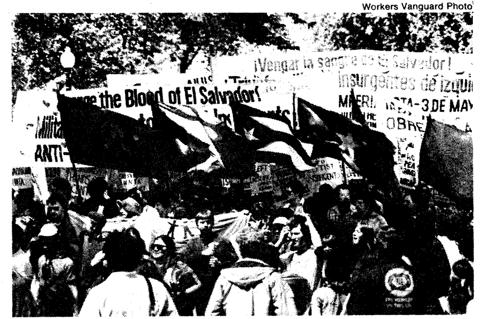
SL/SYL-organized Anti-imperialist Contingent at May 3, 1981 El Salvador demonstration.

In Nicaragua, where sections of the ruling class supported the anti-Somoza revolution for their own reasons, the attempt at class compromise, a "middle