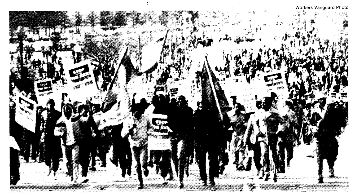
Washington, D.C., November 27, 1982: 5,000 stop the Klan. Targets of Moonie libel: Anti-Klan protesters organized by SL/SYL-initiated Labor/Black Mobilization.

Who is this supremely arrogant Moon who calls himself "Lord of the Second Advent," better than Jesus Christ? Financially dubious, his "religion" holds him above mere mortal laws and the truth. His "Unification Church" systematically destroys families because only he is the "True Parent." Thousands of young lives are ruined by this extremist cult as the Moonies work round the clock like zombies peddling flowers for their "messiah," who resides on a $600,000 estate, owns two yachts and manages a corporate empire which spans three continents. His victims/ followers are married by the thousands in Madison Square Garden as designated couples and consummate the act only at the behest of Unification Church authorities