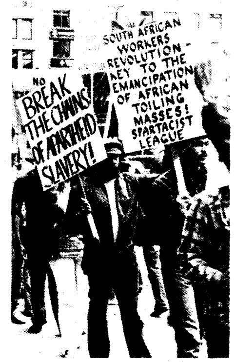
SL/SYL contingent at June 8 NYC demonstration.

The chauvinist tribalism now showing its deadly effect in Zimbabwe is an obstacle to the development of proletarian and socialist consciousness among the masses necessary to achieve genuine liberation. The development of such class consciousness is exactly what the