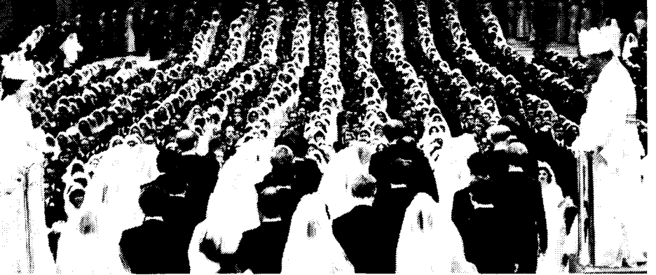
Moonie mass marriage of 2,200 couples in Madison Square Garden July 1, 1982. Couples can consummate act only upon approval of Unification Church authorities.

As a genuine Marxist internationalist organization dedicated to a future