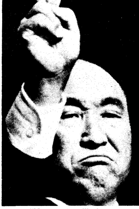
Moon: "My words will almost serve as law."

On November 30, 1982, this Washington Times published a feature article about November 27 with the headline: "Left-Wing Group Linked to D.C.