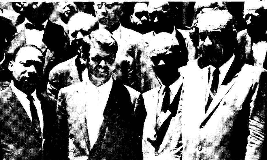
June 1963: M.L. King, Robert Kennedy, Roy Wilkins, Lyndon Johnson. Kennedy authorized FBI surveillance/harassment of King. Dems killed civil rights movement.

Lunches for black schoolchildren are being cut while white-only private schools get tax credits through all kinds of loopholes. In some cities unemployment among black ghetto youth approaches 80 percent. Massive cuts in social services and education have forced an entire generation of black youth onto the streets or into the armed