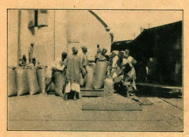
Loading cocoa in the Cameroons at nine pence (18 cents) per day.

The situation today is appalling. The majority of the peasants are ruined and thousands of workers are jobless. Since the unemployed do not get social insurance they are forced to starve. Added to this, the entire native population is forced to pay high taxes in order to enable the imperialists to maintain their oppressive governmental system.