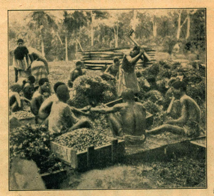
Forced Labour on Palm oil plantation in the Congo.

When the company which owns the sugar plantations of Moabeke wanted to