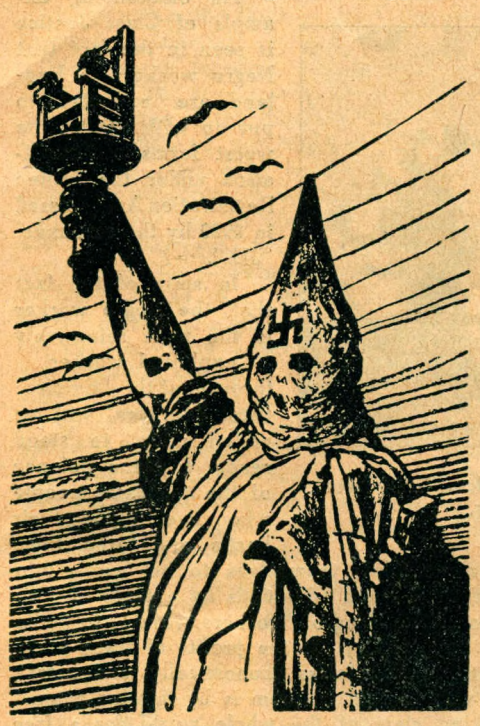
LIBERTY! HERE SHE STANDS!

In the midst of the intense world wide fight for the freedom of the Scottsboro victims, it is well to get a perspective view of the larger issues involved in the case. The Scottsboro frame-up is not an isolated instance of persecution; it is part and parcel of a huge, cold blooded system of oppression and terrorisation of millions of Negro toilers - a system that has well nigh been reduced to a science by the boss class that imposes it.