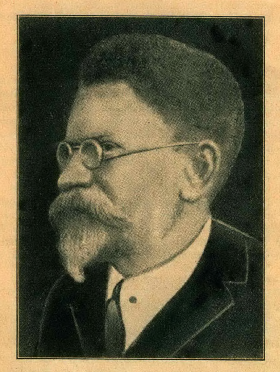
Kalinin, President of the Soviet Union

Nor do we underrate the importance of international treaties and undertakings for peace. My government adhered to the 1928 Paris Treaty at the time and even put it into force with neighbouring States earlier that it was done by the Treaty's own initiators. My government itself makes a practice of concluding mutual non-