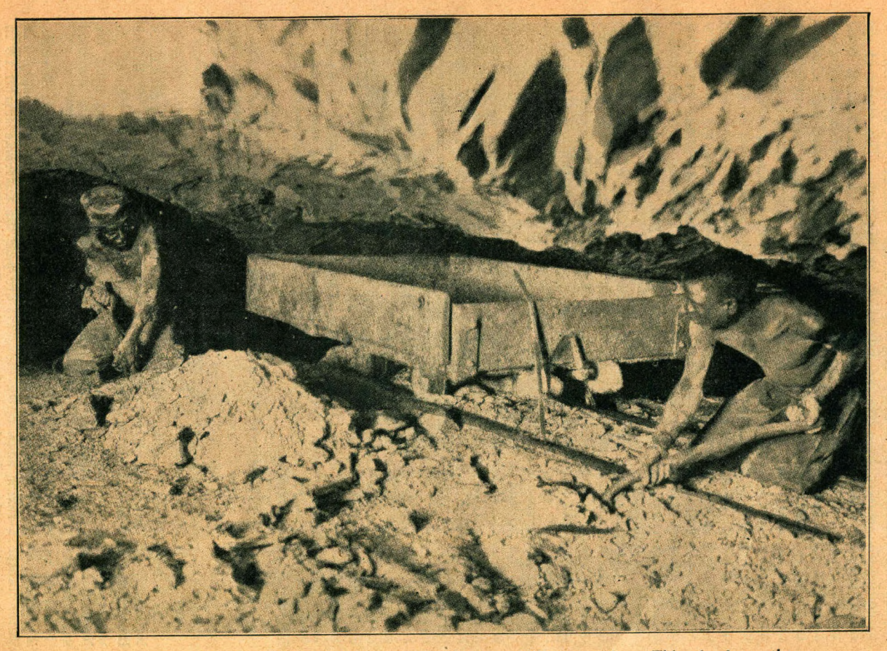
Natives in the gold mines of South Africa working for two shillings per day. This is how the capitalists make their super-profits.