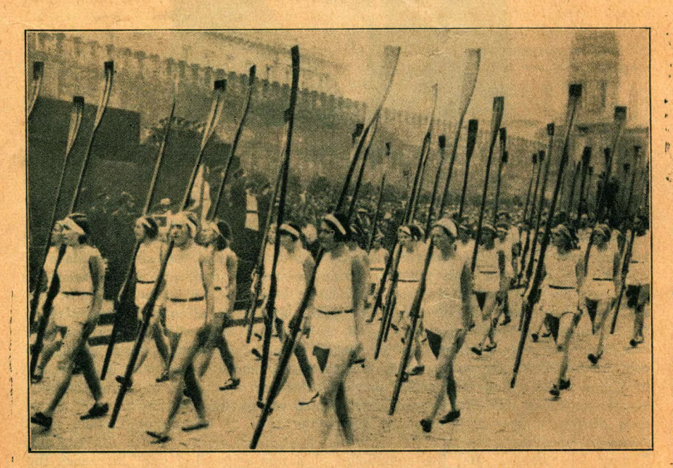
Working girls in Russia marching at a Sports Meet.

The country I represent is in a less favourable position as regards security than other countries. Only 14 years ago, it was the object of armed attack on all its frontiers, of blockade and of political and economic boycott. For 14 years it has been the object of indescribable slander and hostile campaigns. Even now many States, including one of the strongest naval powers, do not conceal their hostility to it, even to the extent of refusing to establish normal peaceful relations, and many States maintaining normal relations with it have refused to conclude or confirm pacts of non-aggression. The present events in the Far East, which have evoked universal alarm, cannot but cause special anxiety in the Soviet Union, owing to its geographical nearness to the theatre of these events, where huge armies are operating, and where anti-Soviet Russian émigrés are mobilizing their forces. Despite all this I am empowered to declare here the readiness of the Soviet Union to disarm to the same extent and at the same rate to which the other powers, first and foremost those actually at its borders, may agree.