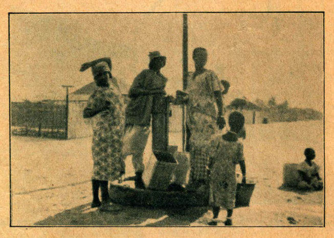
Children carrying water in Duala in order to help their over worked parents.

The workers are terrorised to an unheard of extent. Whenever they endeavour to organize they are simply hanged as rebels. Whenever they complain against their bosses or against the foremen they are mercilessly whipped. The officials of the concession companies are, according to law, considered to be civil servants and, as such are entitled to mete out punishment: even if they kill a native they are not called to account as they acted in the interests of humanity and in defence of European culture. Among the 1,800,000 inhabitants of Cameroon only about