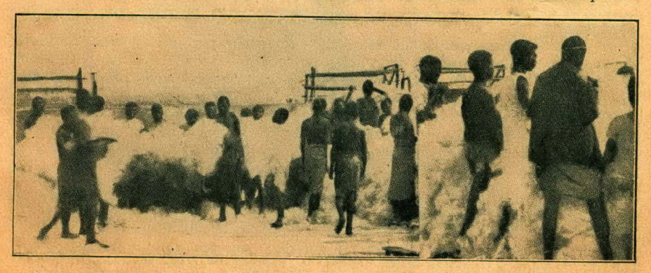
Natives gathering cotton in Uganda, East Africa, to supply Lancashire mills.