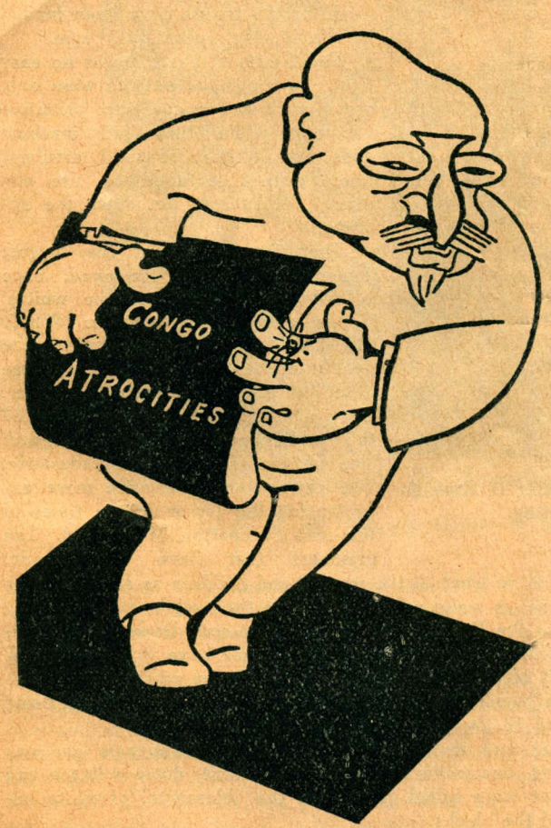
Comrades! "See What I Have Found".

Those white imperialists and their black apologists who are today conducting