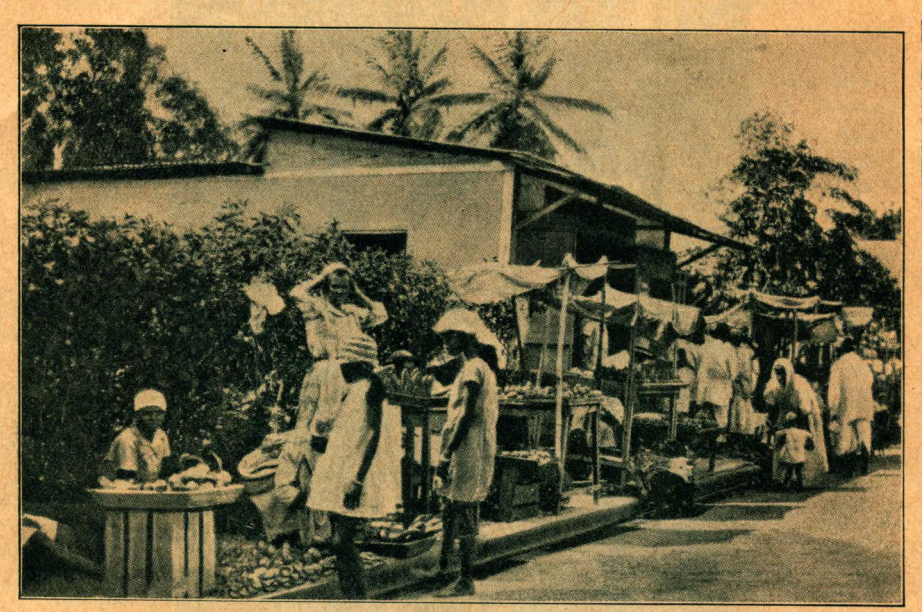
A peasant market along the roadside in Trinidad.

As a necessary pre-requisite toward the dispelling of all illusions in their struggles, the Negro masses of the West Indies must first of all understand their