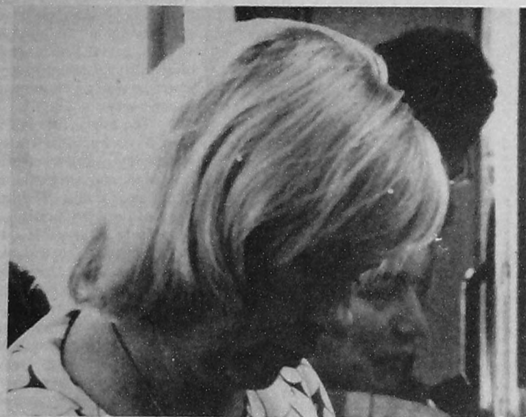
Rosser: trying to win the vanguard by default through censorship

The Morning Star doesn't just censor its news, it censors its adverts too