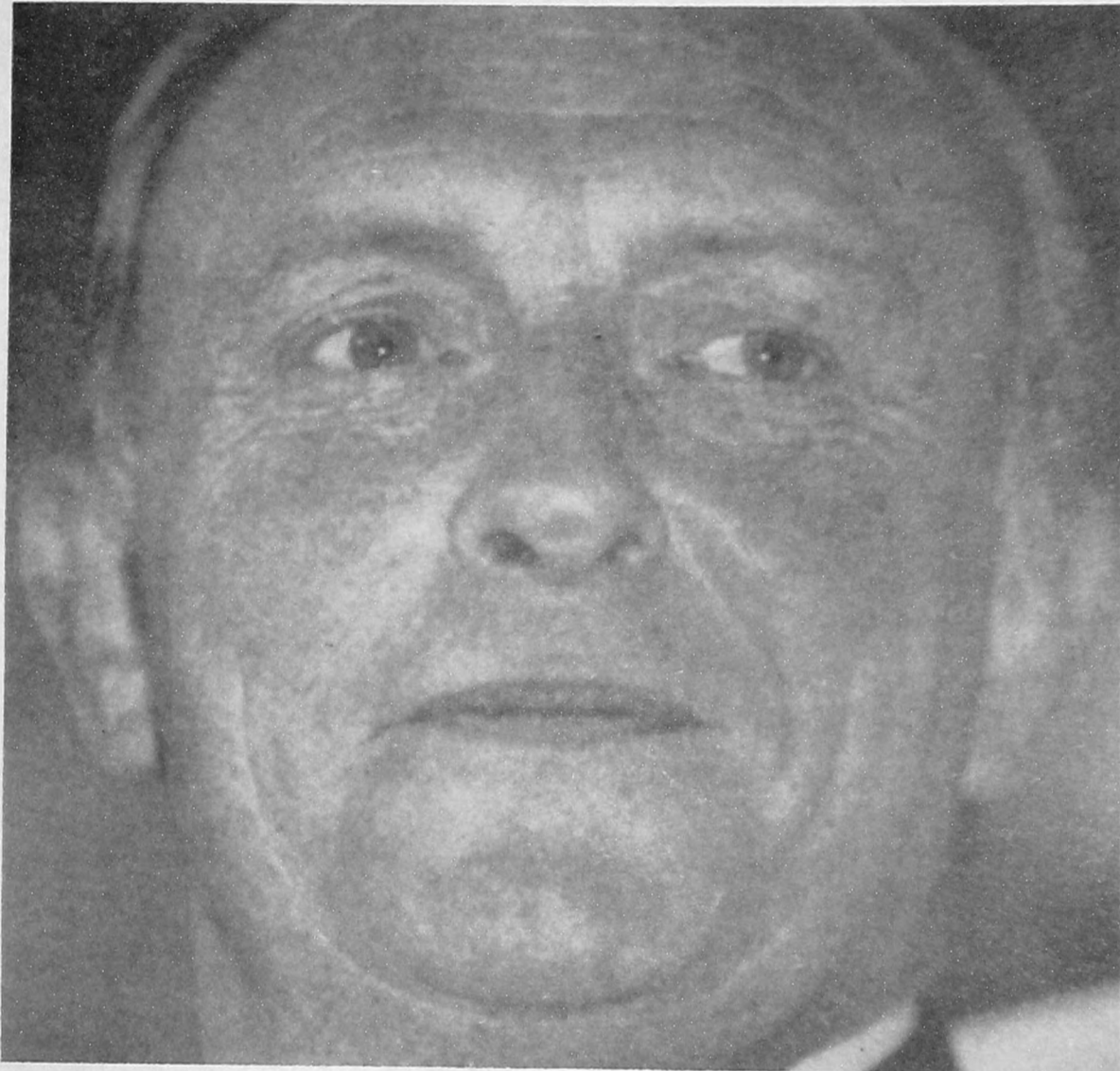
The city brokers' favourite 'socialist'

With the Tories and the economy in crisis the bosses are turning to their second eleven