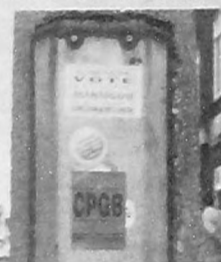
A Liverpool lampost: supporting 'Real Labour' like a rope supports a hanged man