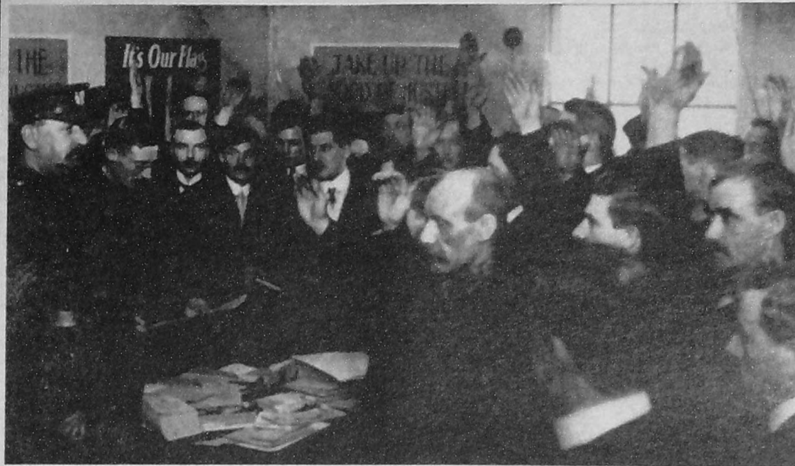
Many communists were repulsed at affiliation to the recruiting sergeants for the trenches

The formation of the CPGB and its early years: documents, resolutions and manifestos