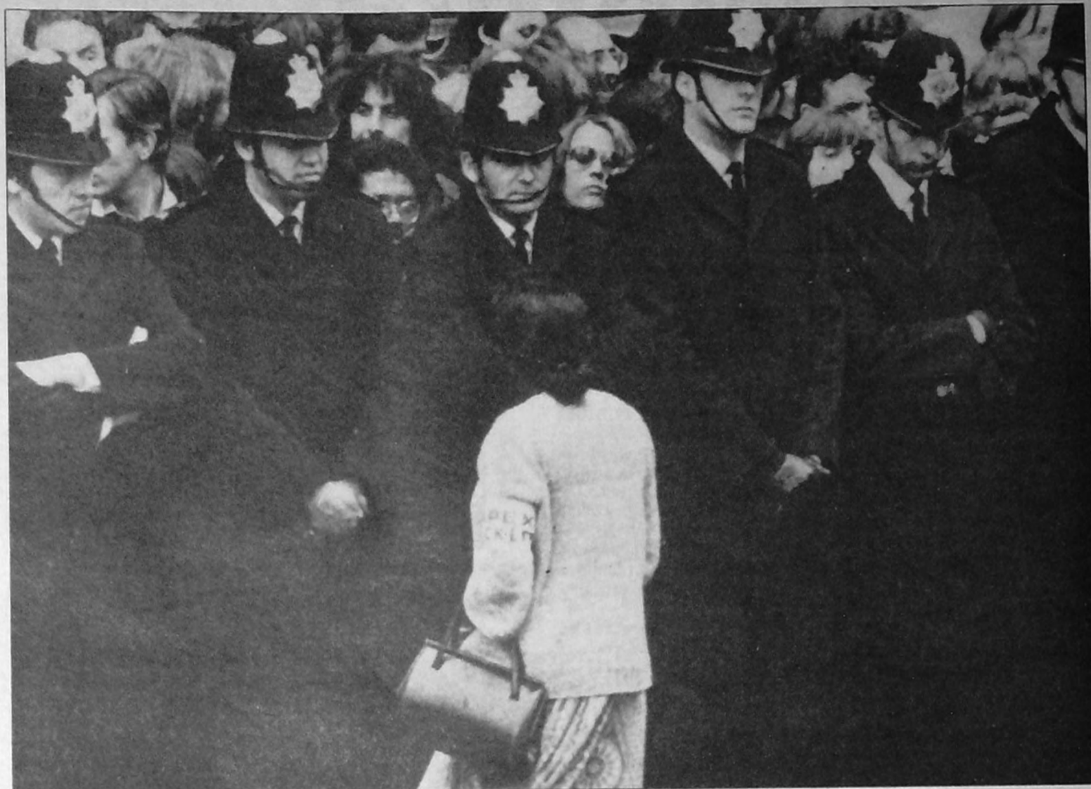
She should have been watching her back, against the trade union bureaucrats

A GREAT Russian revolutionary once made the point that once women have been brought into struggle, they can often exhibit more dedication, vigour and sheer guts than their male class brothers. This is because they are held down, repressed in the literal sense, more harshly than men. Once that latent energy is released, it can spring back with spectacular force.