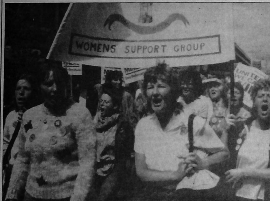
Working class women in the miners' great strike showed the way to fight

International Working Women's Day is about women's liberation. But not in the bourgeois feminist sense