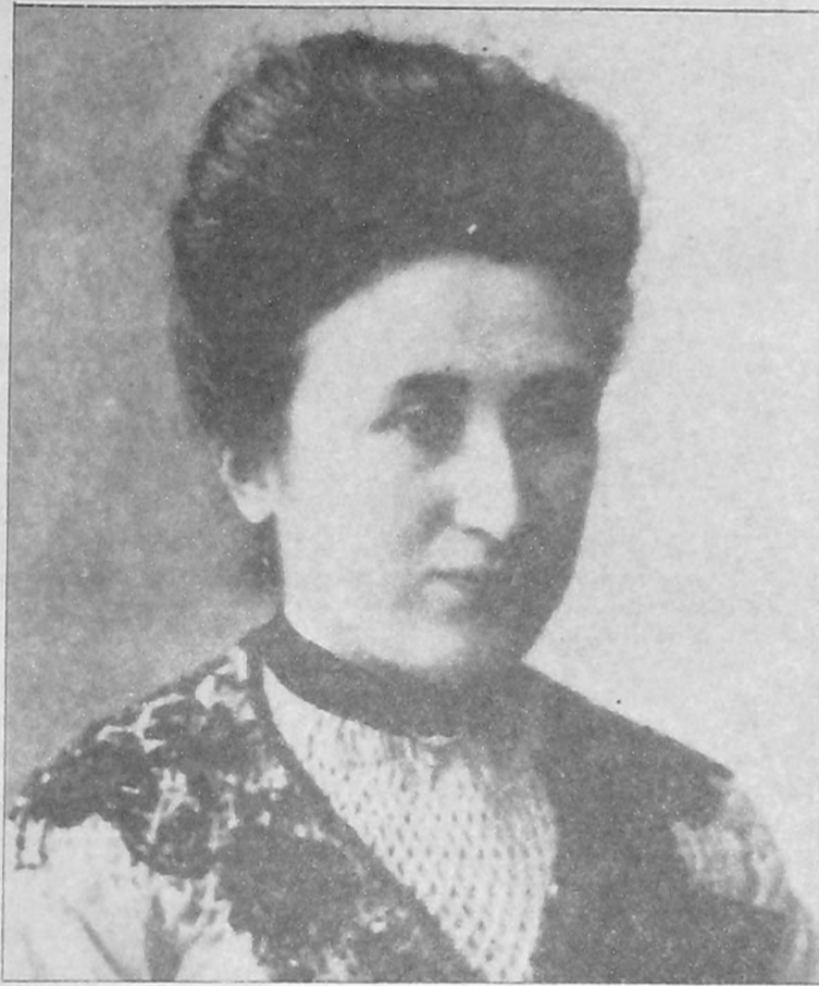
Rosa Luxemburg: working class fighter and revolutionary martyr

The need for greater production and saving of available material will probably force a communal housekeeping system even during the transition period. Women with the ability to do on a large scale what they did before on a small scale will quickly find their places. The others will be absorbed into