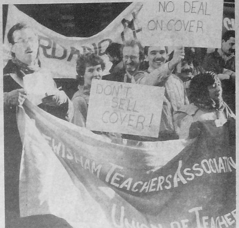
Militant teachers don't want to sell conditions - they want to fight

The outcome of the Scottish teachers dispute hangs to quite a large degree on the outcome in England and Wales. Nonetheless it would be fatal for Scottish teachers simply to passively await developments south of the border. The Main Report covering teachers pay and conditions in Scotland presents Scottish teachers with a threat to their rights and conditions greater than the Coventry deal agreed by the NUT leadership.