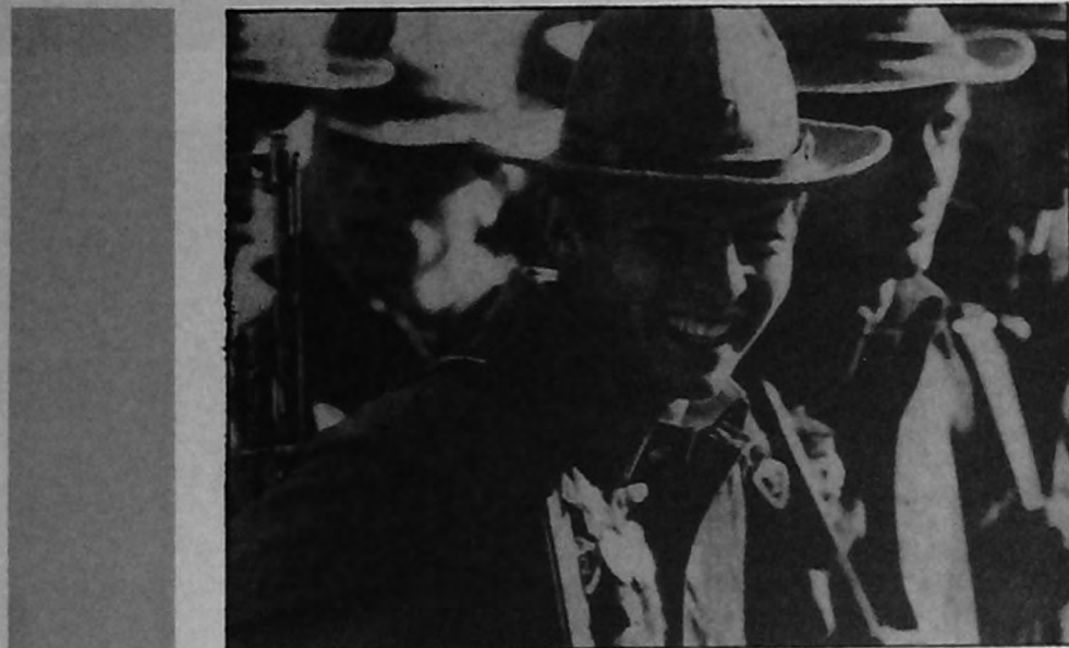
What will happen when the Soviet army pulls out?

IT IS becoming more and more apparent, to both the left and the right of the political spectrum, that the proposed Soviet withdrawal from Afghanistan – now signed and sealed – will mean a butchering of the Peoples Democratic Party of Afghanistan and the drowning in blood of all forces for progress in that country. The Soviet withdrawal will not lead to 'peace' as blockheaded centrists claim. No, it can only lead to the murder of the Afghan revolution.