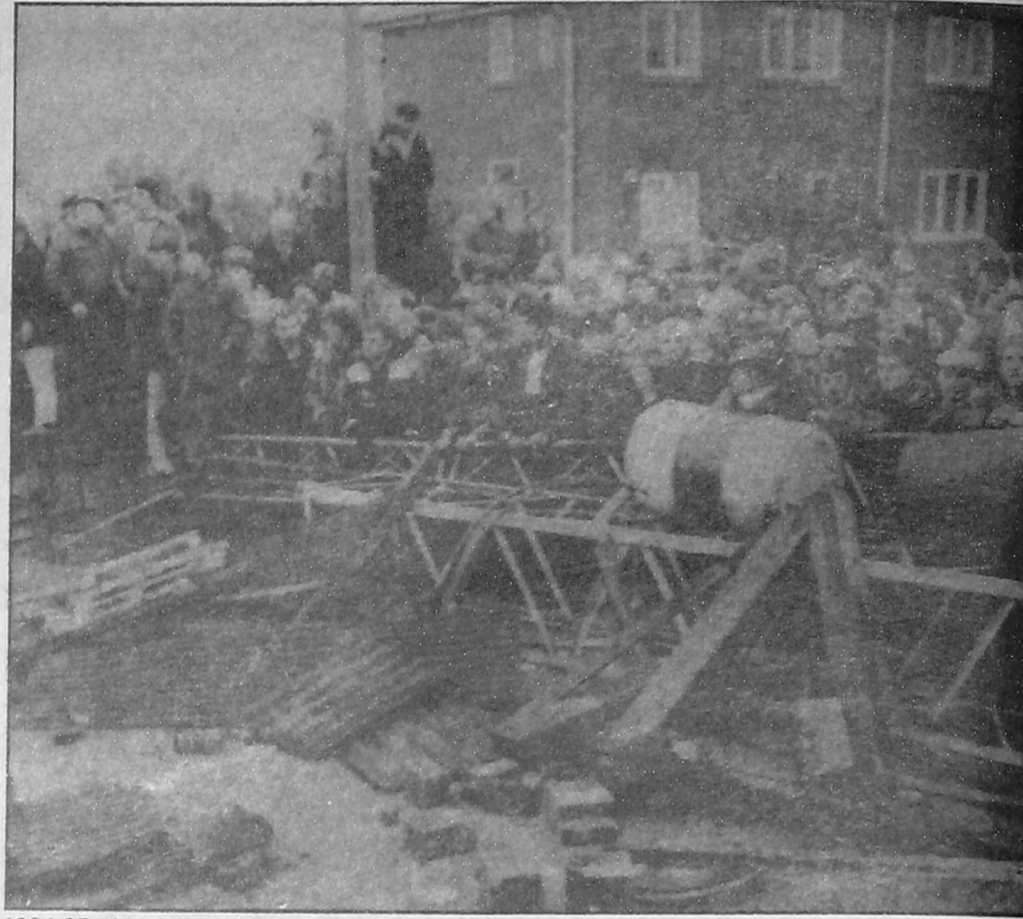
1984-85: the shape of things to come

The Thatcher government represented a quantitative development from those of Wilson, Heath and Wilson/Callaghan. Her government shunned the politics of class collaborationism for the politics of confronta-