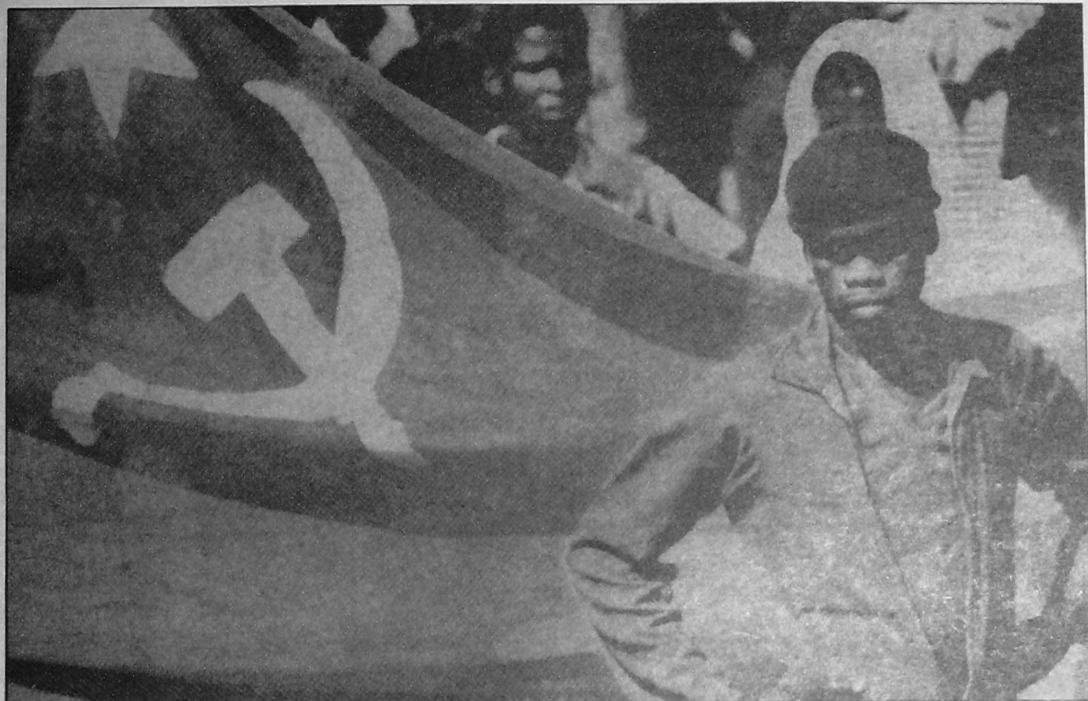
The masses say revolution not reform