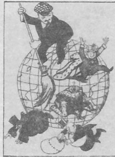
1920: ‘Comrade Lenin sweeps the world’

This is not to say that the artists had been apolitical prior to the revolution. As White shows in his detailed biographies, almost all had been involved in the 1905 struggles. This was when they cut their teeth in a political sense. Art was recognised as a potent weapon in the hands of the forces struggling to free Russia from the shackles of the old order.