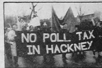
•The anti-poll tax campaign in England and Wales is marching in the footsteps of Scotland. Unless another road is taken defeat is certain

The mass protests against the poll tax in Scotland have shown the potential for resistance to this attack on the whole working class. But what it shows is the need for correct leadership. The campaign in Scotland focused on non registration. That has now failed, and so it has now moved one rung down the ladder to non-payment. This is no more than an apology for a strategy. Instead of having a fighting platform the campaign merely puts the onus onto individuals who can be picked off one by one. This is certainly what will happen. The result of the failure of the official poll tax campaigns has been the growth of nationalism -blame the English. But in England and Wales the anti-poll tax campaign is following in the footsteps of Scotland, a 'bishops to brickies' campaign unable and unwilling to approach resistance on a class basis that doesn't look to the church, councillors, the SNP or Labour Party. We say that workers must look to their own strength as a class, form the sort of fighting bodies that past struggles have thrown up, such as the Miners Support Committees. Such councils of action must build for Britain-wide collective class action against the tax. That, not individualistic responses and big names, is the way to win.