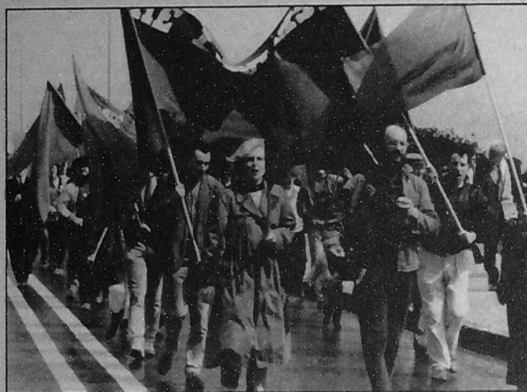
Disciplined, organised and militant: bigger in '89

M AY DAY marches in Britain have traditionally been a measure of the strength not so much of the wider working class movement, but of the communists and the workers they organise and influence in their orbit. This year's march will be no different: it will be a physical manifestation of the relative strengths and combativeness of the different strands of the communist movement.