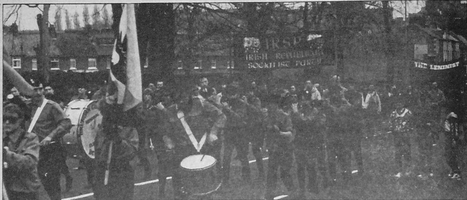
Belfast Easter 1989: solidarity

"Connolly foresaw a similar problem in 1916 when he urged the Irish Citizen Army to hold on to its guns in the event of victory because the fight would not be over until the social struggle had been won. We believe that