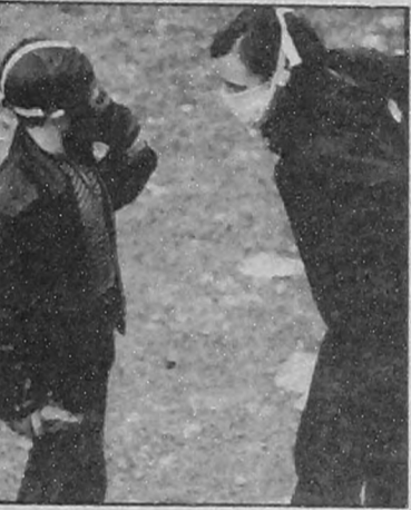
Bernadette Devlin: MP and street fighter

Perhaps PD is now best remembered for the election in 1969 which got the fiery Bernadette Devlin into the House of Commons. But the fact that PD suddenly found itself with an MP and a mass following sowed the seeds of destruction. Because of its Trotskyite politics PD could not fight for revolution in practice. We were "confounded", writes Michael Farrell of the election of Devlin. "Ultra-leftism about parliament and our own loose structure meant we did not know what to do with an MP. The result was confusion and some resentment between Peoples Democracy and its new MP" (p59). In fact the PD found itself in terminal crisis.