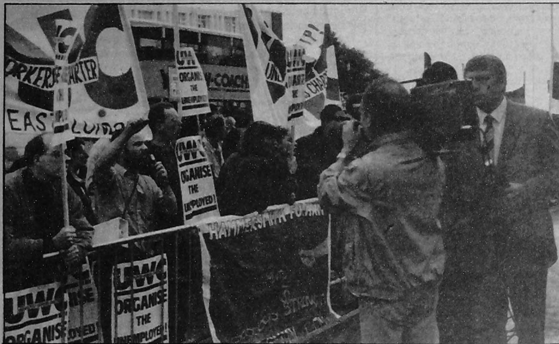
One lobby: worth 1,000 TUC resolutions

O VER 40 delegates and activists, representing a broad geographic and political spread, attended the Action Against Workfare' organising conference on March 18 in Manchester. The delegates gathered to both review the strengths and weaknesses of the campaign against ET so far, and also to lay down more detailed plans for the June 15 national protest against this cheap labour scheme.