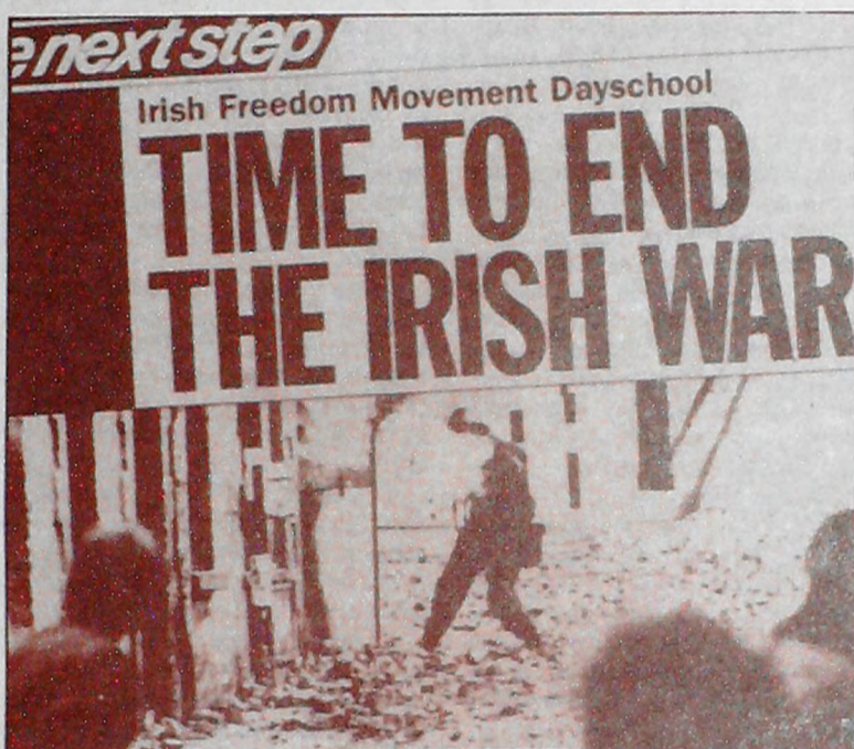
When wasn't it time?

All this the Irish Freedom Movement and its parent body, the Revolutionary Communist Party, would no doubt agree with. But