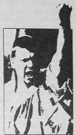
March against the poll tax with the UWC

On April 30, striking nursery workers from Hammersmith and Fulham council returned to work. They had been on strike for six months, fighting for a regrading claim. Despite voting to go back to work, they have refused to agree to the package that management imposed on the scabs who worked through the strike, a review of which has been agreed in the near future. By the end of the strike their fight was concerned more with protecting services and preventing cuts by the Labour council than about pay. Management saw the strike as a good opportunity to close some nurseries permanently. The workers, however, won a commitment from the council that all nurseries would open on their return to work. Although this dispute has not yet resulted in victory for these workers, there have been some very positive aspects. The fact that only a couple of the original strikers returned to work during the six months shows the unity, solidarity and determination that existed. However the failure of the rest of the Nalgo branch to take the decisive all out strike action that was needed to win the dispute led eventually to the return to work. The organisation, involvement and militancy of these women workers has set a fine example to the rest of the branch. Workers in this poll tax-capped council will face more bitter battles in the future. NS