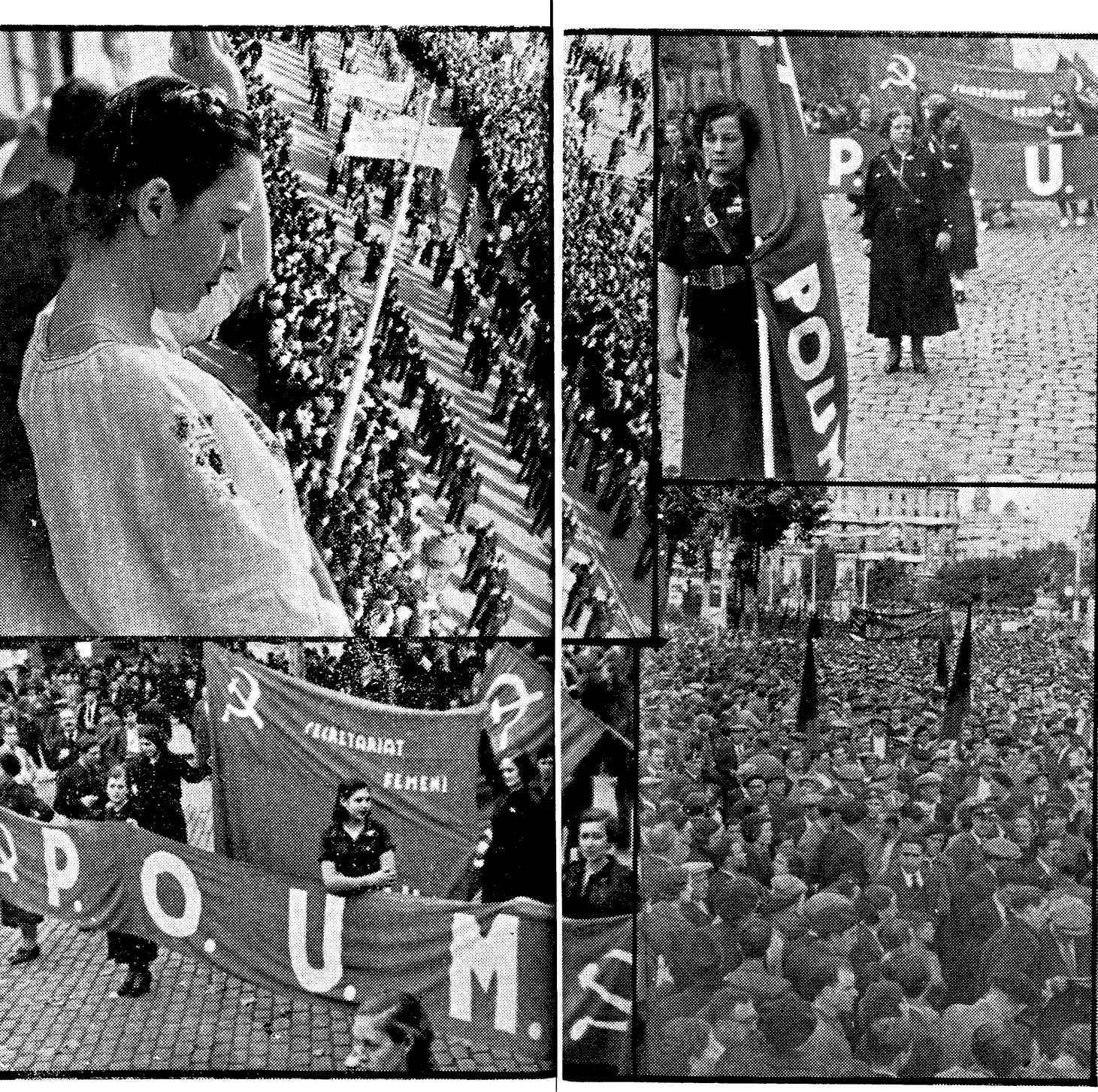
The above pictures show some of the workers who took part if the huge demonstration in Barcelona last Sunday. 300,000 workers marched with tremendous enthusiasm to commemoral the Russian Revolution and showed their determination at the same time to carry the Spanish Remution through to a triumphant end

More then 300,000 workers demonstrated in Barcelona on volutionary struggle of the working masses of Spain. For this reason, the civil war and the revolution are both developing at the same time. The Mencheviks of our revolution, although under another name and claiming to be the inheritors of the teachings of Lenin, fear now as they did during the Russian revolution that the realization of our revolution will bring them into opposition with world «democracy». These so called