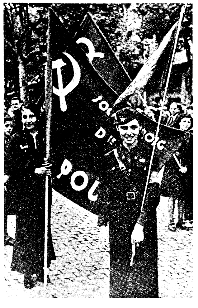
Help The Red Aid of the P.O.U.M. We need money, clothing and medicine for the refugees from fascism

Those who are creating obstacles to avoid victorious action on the Aragon front conduct themselves most shamefully. Ir.stead of remaining silent out of a sense of guit, they push themselves to the fore on the streets, at meetings, in the press. and unleash a campaign that we others have refrained from carrying on, although, bearing no responsibility for what has happened, we might justly have done so. We all know the true reasons that have prevented the launching of an attack on the Aragon front. We all know that there are more than enough means at hard to do so. We understand why these people are interested in having the Aragon front remain perfeetly quiet with no decisive operations being undertaken.