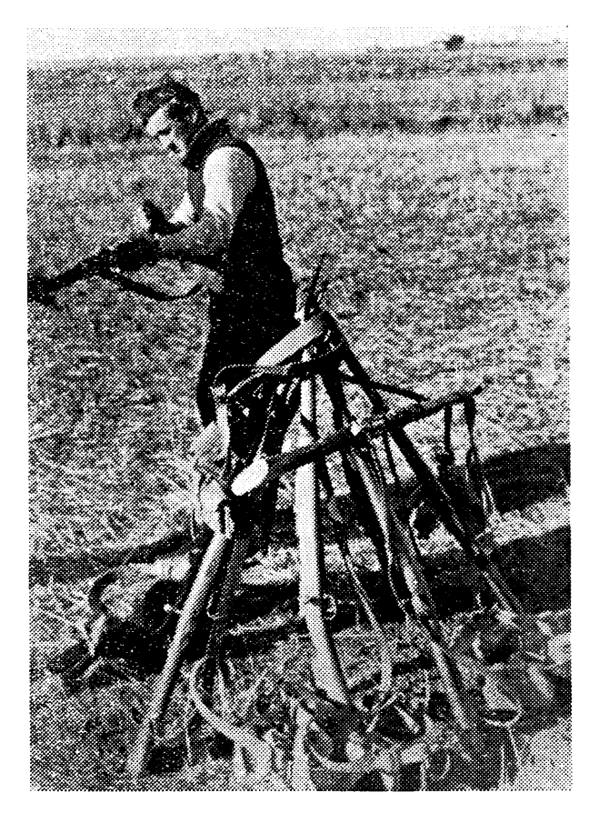
No Militarism! No Betrayal! The Workers in Arms!

Without a class character. It admits everybody. An exclusive military command. Military discipline excluding all working class thought. Its aim is to defend the capitalist democratic regime which all workers know has utterly failed in Spain. This means that it will be controlled by the capitalist democratic politicians who will use the Peoples' Army to crush all revolutionary activity of the workers. This means that the military control, purely military, places itself above everything else, above the demands of the working class.