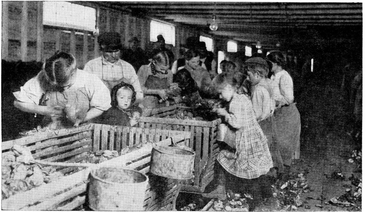
OYSTER SHUCKERS, EIGHT AND TEN YEARS OLD, WORK TEN HOURS A DAY.