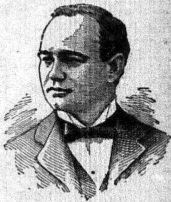
Who Has Just Closed a Successful Lecture Tour of the Northwest.

ceptions, it will be said. But let us give due weight to the exceptions. Karl Marx, for example, was anything but a wage-earner, either by birth, training or position.