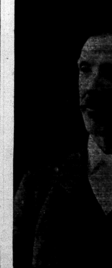
Who retired from the presidency of the western Federation of Miners last year because of ill health.