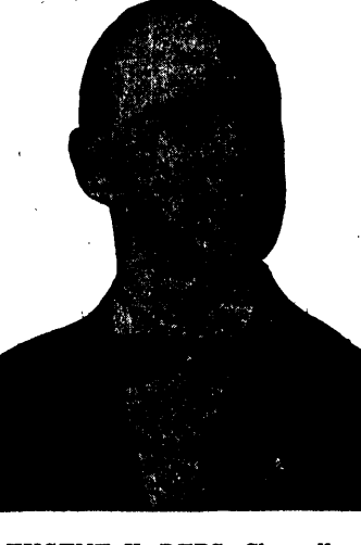
EUGENE V. DEBS, Chancellor

Every reading, earnest, thinking worker can now learn law. You do not need a college education or even a high school education. Can you read and write the English language understandingly? That is education