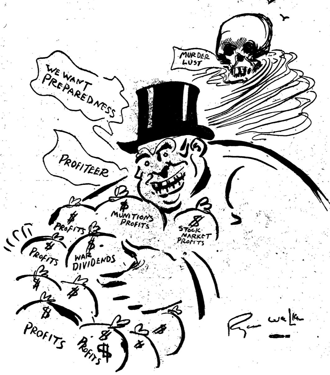
Is This Your Brand of "Preparedness Patriotism"?

Federated federations of labor, by general strike, at the ballot box, can unhorse every cunning capitalist lickspittle on the bench and in the legislative halls whose business is to betray labor and whose fees from capitalism,