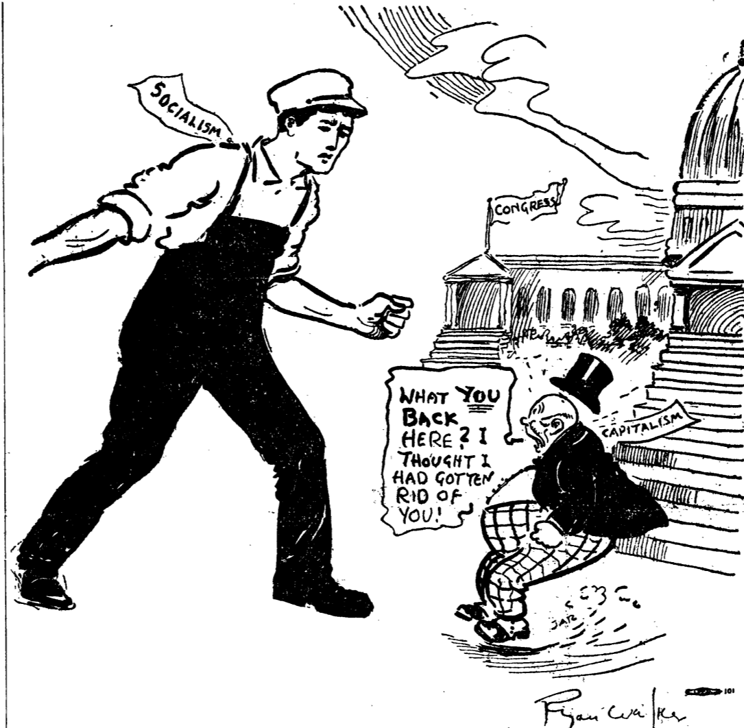
Meyer London Takes His Seat in Congress Monday, December 4th.

Looking at the question of preparedness from its different angles, as presented by its advocates, and comparing them with our international relations and the industrial situation in the United States, my conclusions are that the capitalists are using the slogan of invasion as a cloak to hide their real purpose. When the European powers were prepared for war, no one feared invasion. Now, when the European nations are torn to pieces and loaded down with debts running into many billions, its fighting population reduced by many millions and its citizens, in a great measure, reduced to women, children and cripples, we are told that there is danger of invasion. "But," say the skeptical, "what