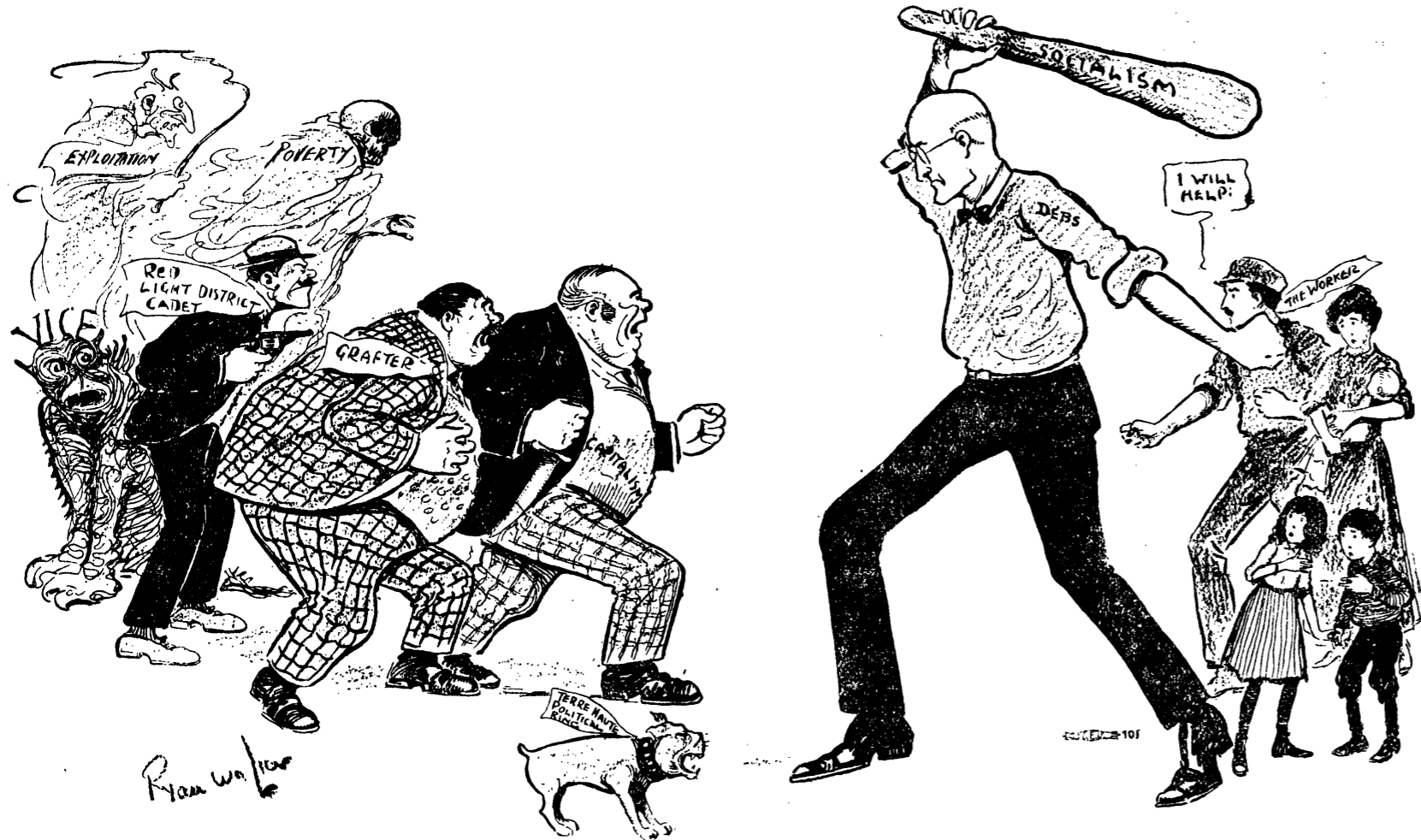
VOTERS OF TERRE HAUTE: Which side are you fighting on?