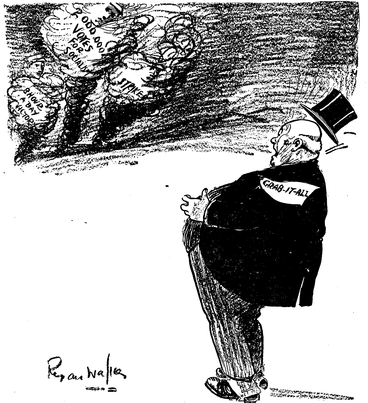
GRAB-IT-ALL: Here come three cyclones and they'll all hit me.