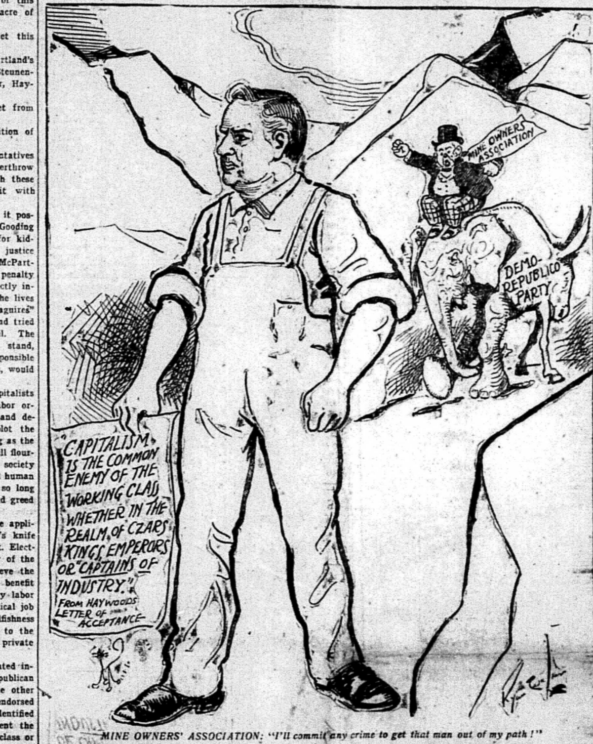
...MINE OWNERS' ASSOCIATION: "/>

party. No party can do that without becoming the Socialist party.