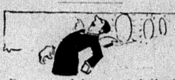
DOLLARS put halos around the heads of many scoundrels.

In this issue of the APPEAL, you will find a subscription blank. This subscription blank was placed in this copy of the APPEAL, by one of the young women working in the mailing department. It is an invitation from her to you to get a new subscriber for the APPEAL. If you want to make the APPEAL force-happy, take this subscription blank and write as many names as you can secure. Note that there are no lines on the subscription blank. There is no union label. The postoffice department ruled the lines and the label out of order but that should not interfere with your work in getting subscribers; although it was intended by the Washington functionaries that such should be the case. Some members of the APPEAL Army have been known to send as many as twenty-five subscriptions on one of these blanks, although originally only intended for ten. This shows how respectful the APPEAL Army is toward our rulers who infest the capital of the nation. An early reply, with a club of subscribers, will be eagerly looked for.