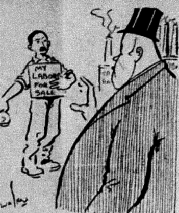
The only thing the worker has to sell—his labor power.

If not already sent, let us have your order today. Send no money, all we want now is the order—we will notify you when the books are ready and you can remit at that time.