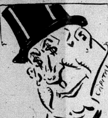
The soul is often reflected in the eyes.