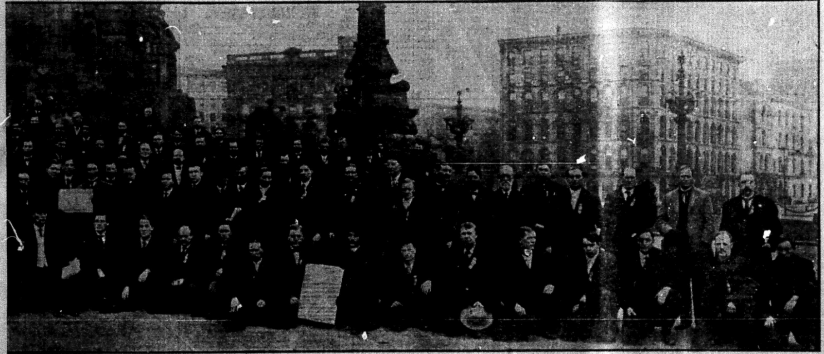
INDIANAPOLIS, IND., FRIDAY, JANUARY 31, 1908.