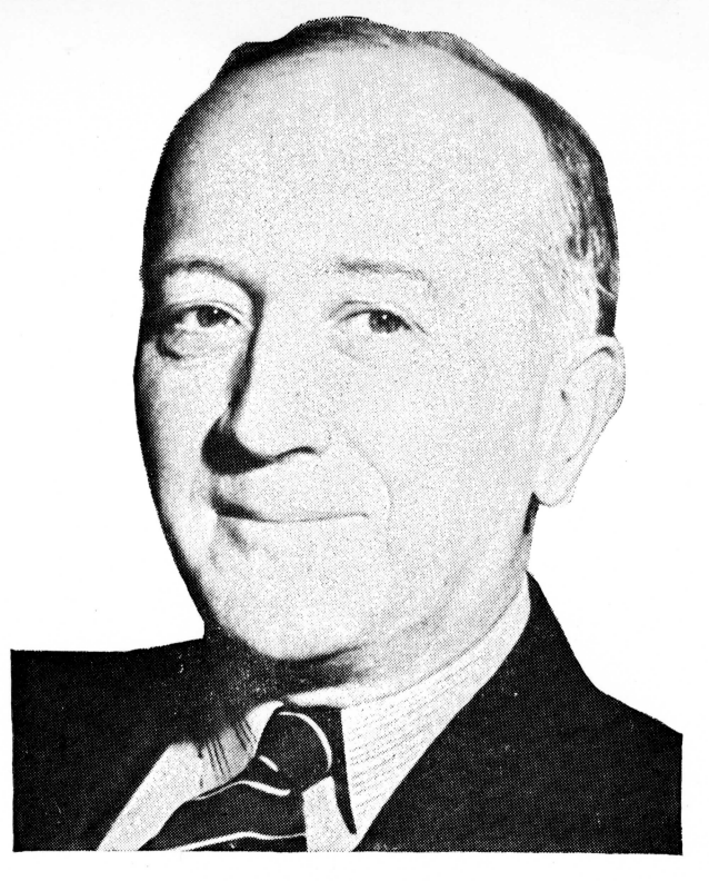
WILLIAM Z. FOSTER National Chairman, Communist Party, U.S.A.