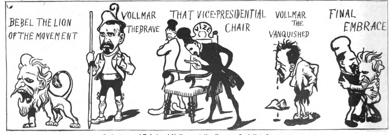
Caricatures of Bebel and Vollmar at the German Socialist Congress

What is the psychological atmosphere of the Socialist movement? The answer is—boundless optimism. When we enter thoroughly into the intensely animated, vibrant life of the Socialist movement, we feel that composite exhiliration which Fourier intended to become the motive passion of his Utopia. The burning conviction that the world, the universe, known or unknown, cannot contain a cause more rational and just that ours is; the consciousness of fellowship with men whose thoughts pulsate in rhythm with your thoughts: the exhilaration of a struggle with an enemy, strong, desperate and tenacious, with the odds, however, not all against you,—all this creates an atmosphere of hopefulness. And we enter joyfully into the struggle; and we fight battles which the Homeric gods and heroes might have envied.