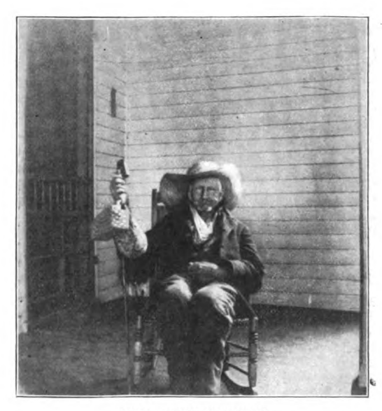
THE AGED BEGGAR

The aged wanderer from the dusty road Besought assistance at a little farm, Whose shady shelter could all sorrow charm, And make the heavy heart forget its load. That lovely home was blessed love's abode, And there the traveler ventured not in vain. Water to wash away the sweat and stain— The welcome of the noble orient code— And then a seat about the family board, The placeo f honor at the father's right. His tramp apparel lost the while to sight; The sentiment of manhood full restored; The smile of mother making sweet the meal; And, ah, what memories o'er the wanderer steal!