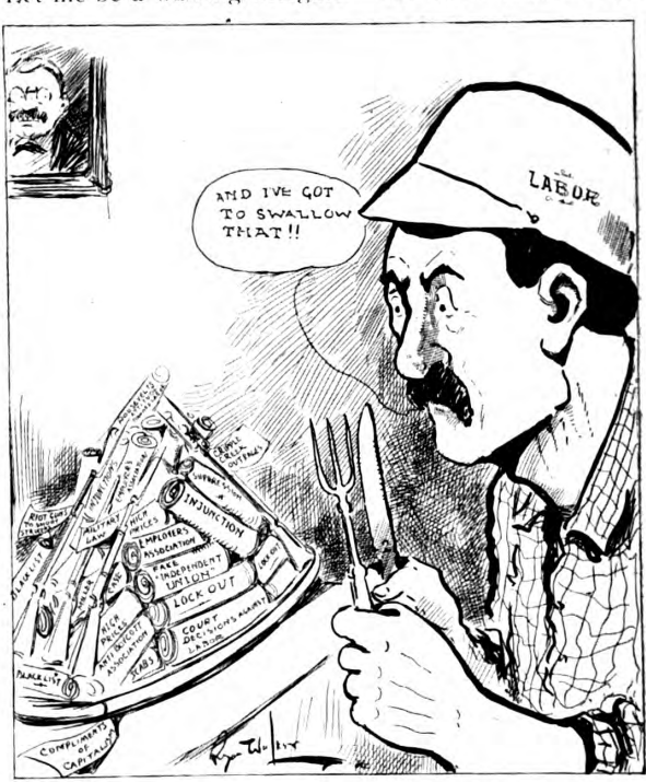
AN INDIGESTABLE DISH

Let me be a walking delegate. Let me continue to walk