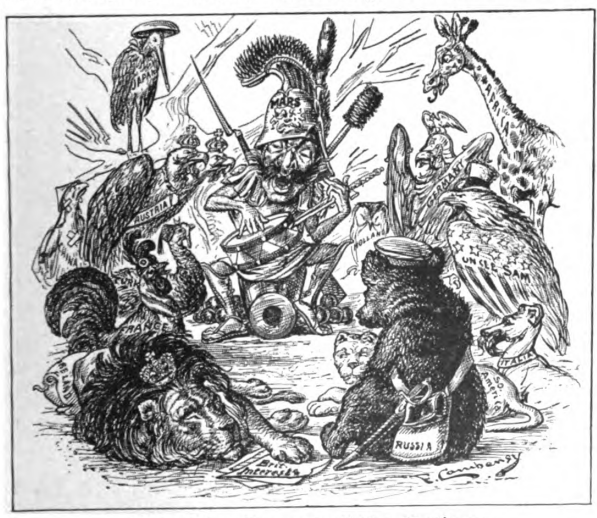
The War Concert of the Nations

There is a steamer plowing the Atlantic. It sits twentytwo feet deep in water, for it is loaded to the brim with coal. This is Capital, sure enough. The steamer strikes a reef and goes down. There it rests on the bottom of the sea. Is it Capital or not now-the steamer and the coal? It is none the less an instrument of production for being on the bottom of the sea. Some may be inclined to dispute