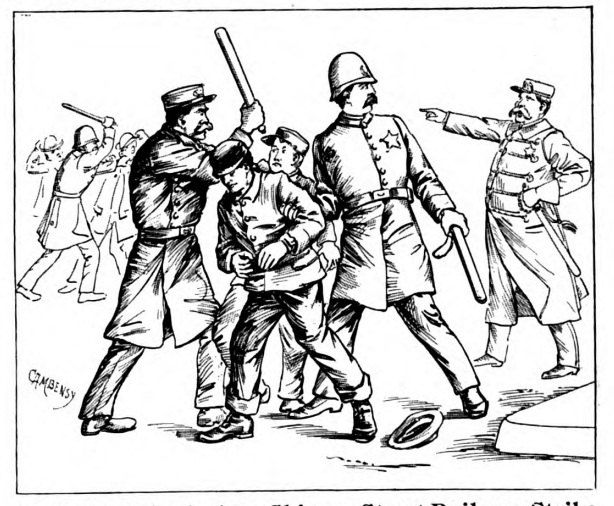
An Incident in the late Chicago Street Railway Strike