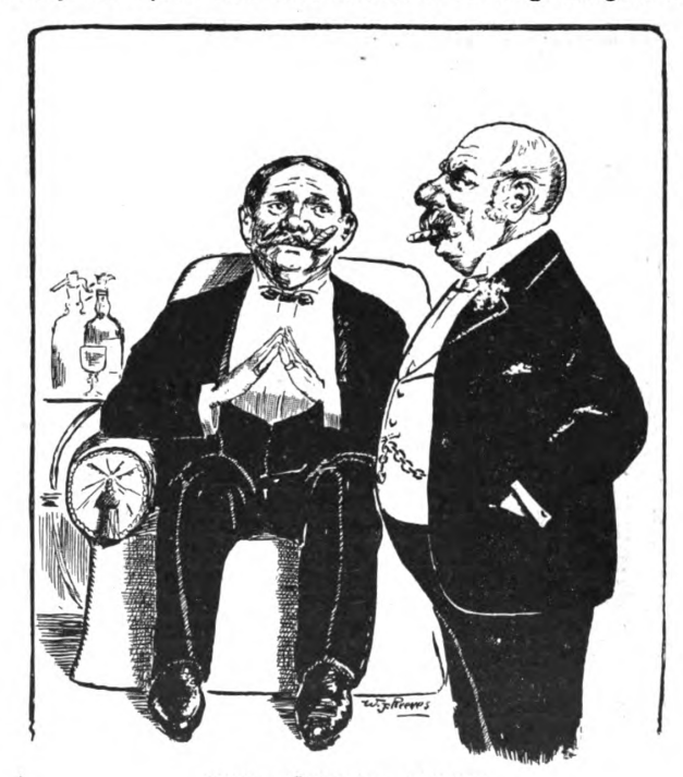
MORE SOCIALIST CRITICS OVERHEARD AT THE CLUB. How. Donougur: "These Socialists, my dear Major, are downright brigands. They actually propose to confiscate what we have worked hard for—er, that is to say—realised." Major Joilynoo (who appreciates the humour of the observation), sarcastically: "Yes, the scoundrels, I believe they would even rob a blind man of his eyesight!" [The Hon. Donought is still wondering what the Major meant.]

Every time you have browbeaten a gang of workmen. Every time you have confounded a walking delegate or