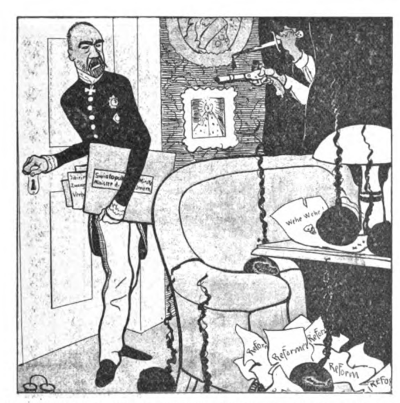
SVIATOPOLK-MIRSKI'S OFFICE—The Russian Ministry of Interior —Ler Wahre Jacob (Stuttgart)