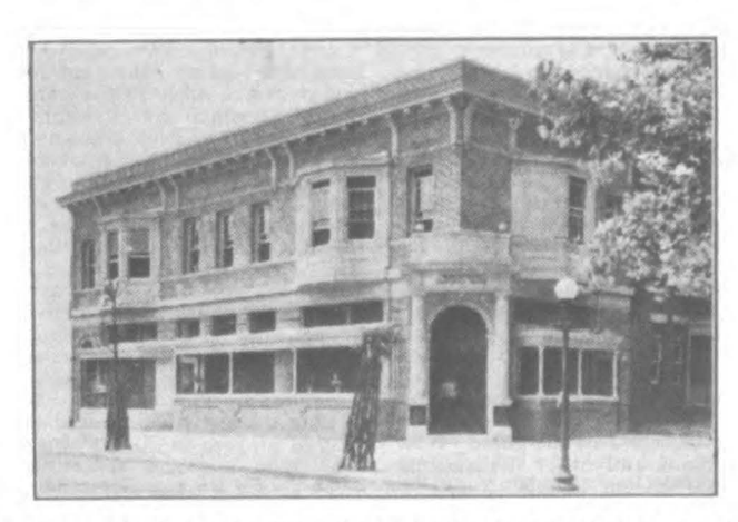
Industrial Savings Bank Building, Washington, D. C.

The future would be fraught with great pos-sibilities for a commission of responsible colored men acting in the interest of clean sport. For the first time the much abused people who pay to see games would be insured against the many deplorable incidents which have taken place in the past, and when clubs and players realize that they can be haled before a court of their own selection that would firmly ad-minister the laws, the "Dove of Peace" can spread her wings and seek other fields of conquests while the olive branch would be the symbol under which basketball could lay the foundation for a brighter future for the young-ster who would then be inspired by the high ideals made possible by the vision of his fore-