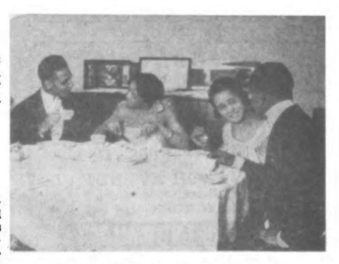
ILLUSTRATING TABLE MANNERS

Over fifty pages of pleasing pictures taken from best photographs. A BIG BOOK, containing over 400 pages. The people are much pleased with this new publication and are sending thousands of orders to us. Order today. We send by insured parcel post. Price ONLY $2.50 cloth, $3.50 half morocco. Write today. Money refunded if not satisfactory.