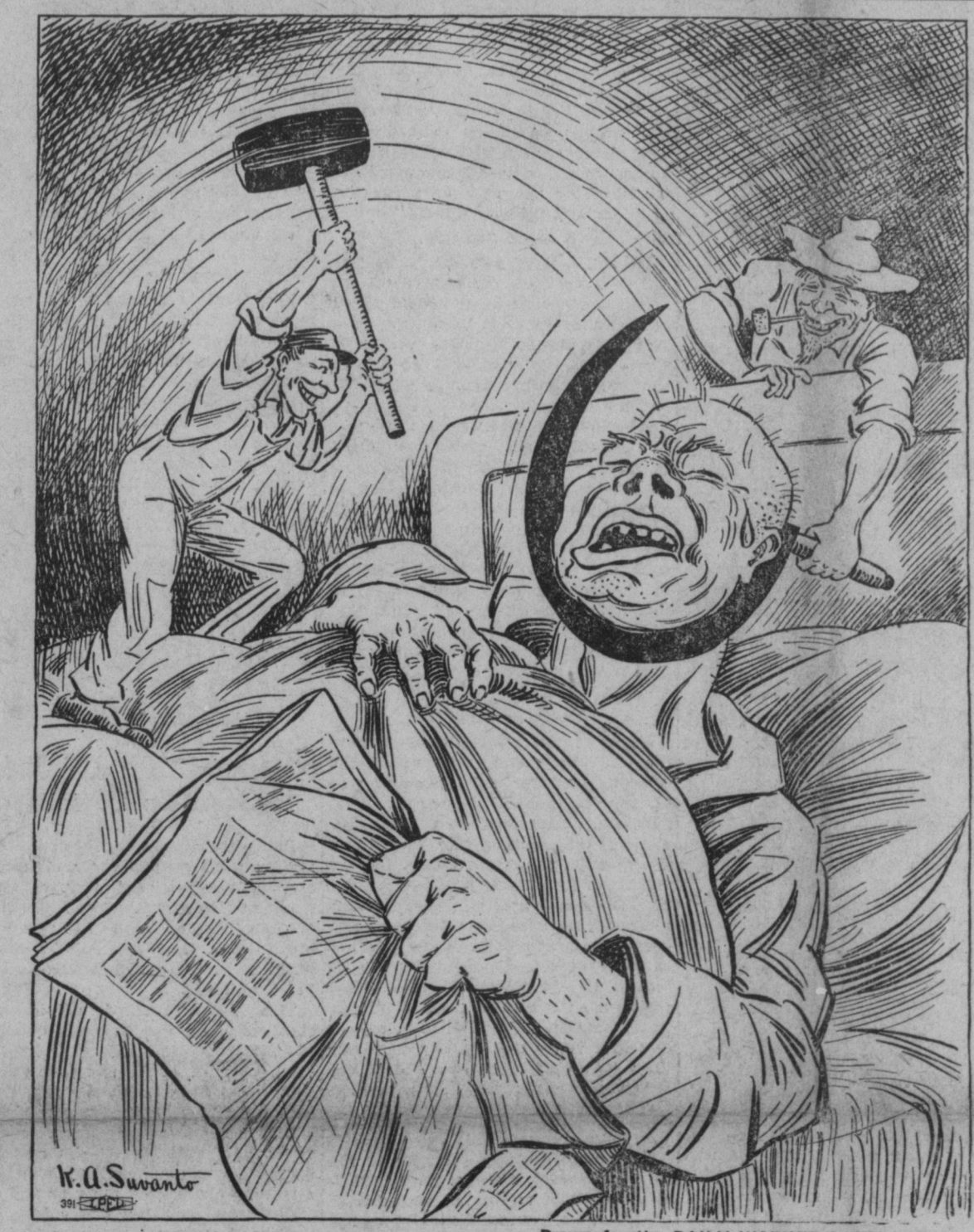
ADVICE TO THE ROBBERS OF THE WORKERS AND FARMERS:—Better be careful what jail for 17 months—I'll say that for him. But in a letter he wrote me reading in his newspaper that Communists are running the farmer-labor movement.