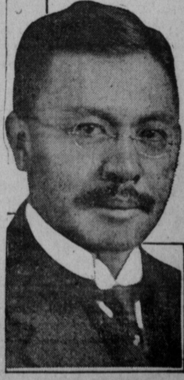
VISCOUNT KATO He may occupy the post of premier in the new Japanese coalition government. He is known to favor recognition of Soviet Russia.

MOSCOW, June 4 .- The Trade Representative's Mission of the Union RECENT JAPAN ELECTION OVERTHREW OLD MINISTRY WHO WERE ANTI-RUSSIAN