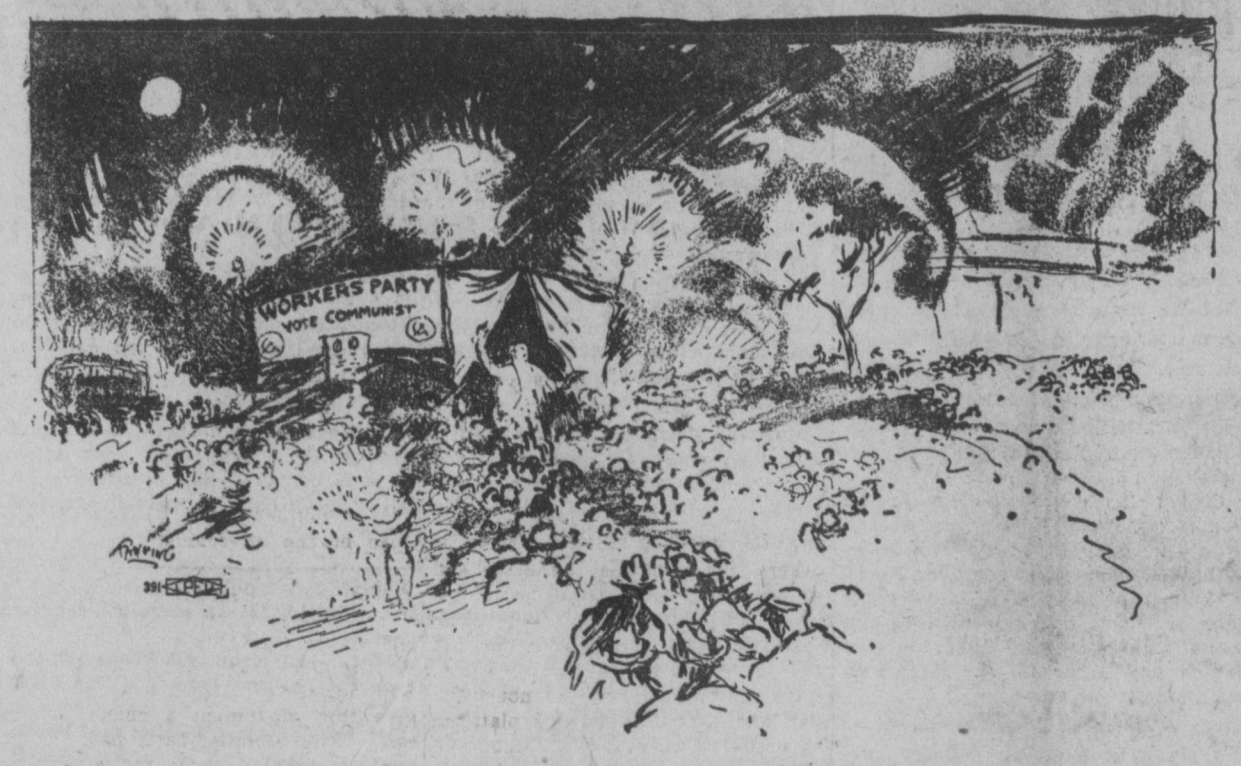
Corner of 110th St. and Fifth Ave., Night of Oct 10.