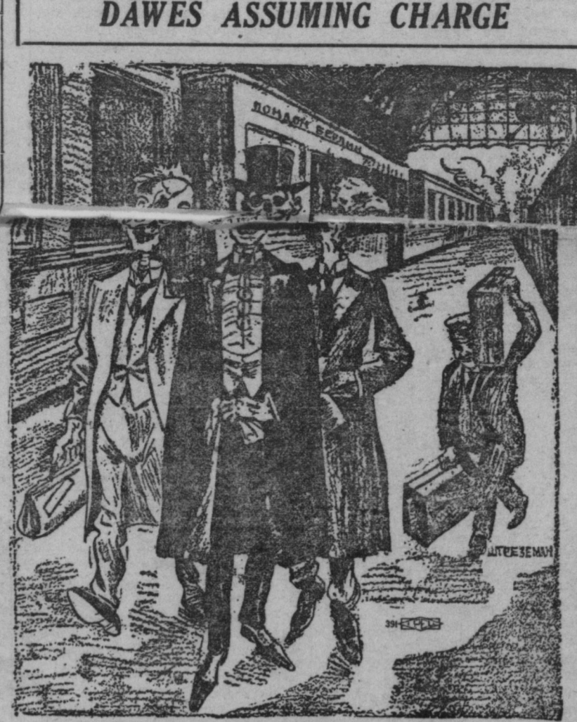
Misery for the Workers-More Profits for the Rich.

3. Self-instruction Classes in the "ABC of Communism." A whole network of local self-instruction classes